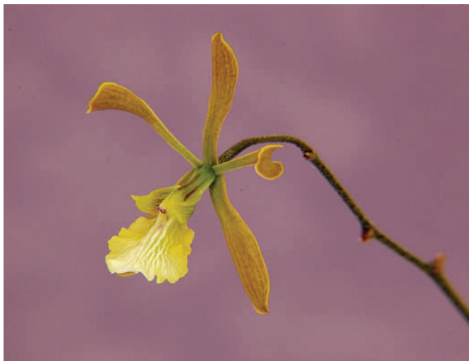
Above is an Encyclia aspera ; below is a L. anceps alba x Dialaelia Snowflake _ Mendenhall'

All of these considerations have been built into an Excel spreadsheet which contains formulas for calculating points for each meeting and show for each member of the Guild and for all meetings and shows for each member. From this spreadsheet detail, summaries must be prepared and published during the year so members have an opportunity to review their points earned year to date. The final summary provided the basis for the awards. The spreadsheet provides the backup for summaries if questions arise.