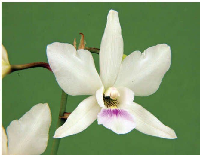
Below from the Bolz Conservatory, on the left is a Bulbophyllum grandifolium ; and on the right a Phalaenopsis sumatrana