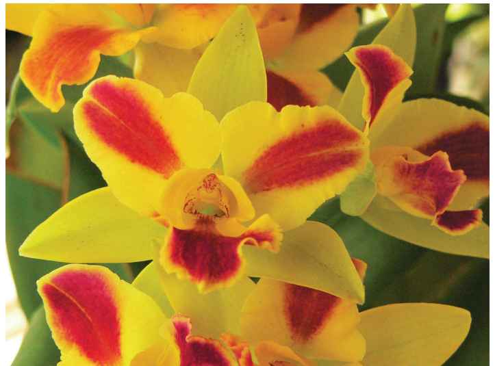
Potinara Burana Beauty

Since the 2003 Awards Policy revision did not specifically state that it replaced all pre-existing policy, it is assumed that all prior Awards Policies, not addressed in the 2003 revision, remain in place. One issue this raises is that an AOS award is now worth the same number of points as a Best of Class award. This has not been a problem because AOS award points have not been earned by Guild members – but could be an inequity at some future time.