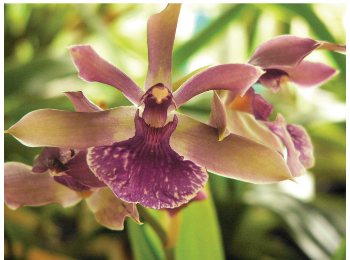
Zygopetalum 'Cardinal's Roost'