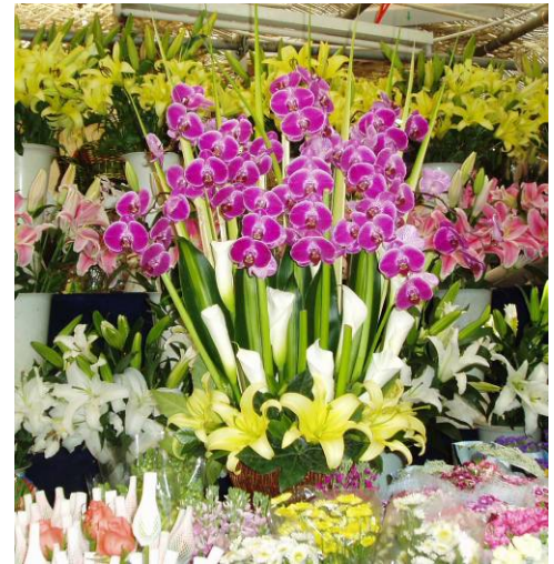
Floral arrangements incorporating orchids

Orchid Grower, September 2008, page 3 of 8