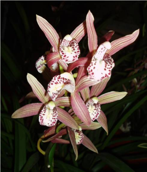
Cymbidium at a greenhouse market

Our impressions of China were varied. The country was very excited to be the hosts of the 2008 Olympics. “One World, One Dream” was advertised on the television, at the airport and on billboards. The people are proud of China and were friendly and warm toward us. They were anxious to show off their famous sites such as the Forbidden City, Summer Palace, and Temple of Heaven, which ten years ago tourists would not have been allowed to see. We also saw the “Great Wall” which had been open to tourists. Much has been done to restore these sites to make them ready for Olympic tourists.