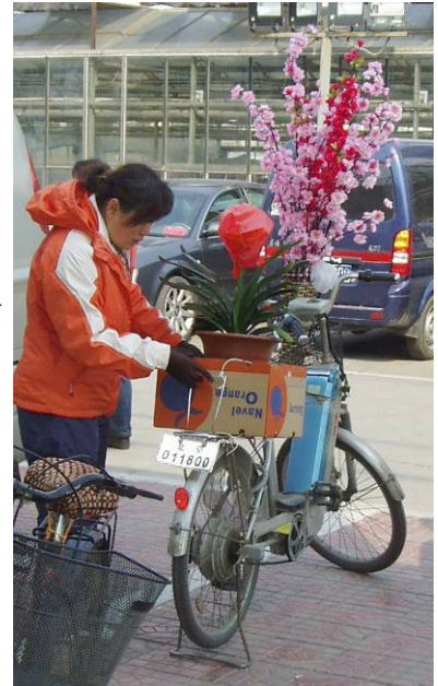
Heading home with her floral display

area around the China Agricultural Science Academy (CASA). Near the Plant Pathology Department, there was a complex of greenhouses which CASA sold to private industry because they were too expensive to maintain. This is where I would go to get my "orchid fix." Numerous vendors sold orchid plants or arrangements of orchids for weddings or funerals. Almost none of the orchids were identified, but I enjoyed them just the same. Surprisingly, one grower was from Taiwan. He explained that relations between mainland China and Taiwan had relaxed so that now he was welcome to sell his