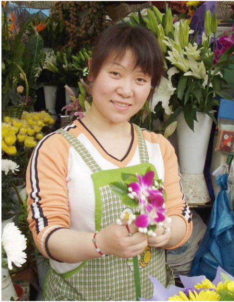
Woman constructing orchid corsage

area around the China Agricultural Science Academy (CASA). Near the Plant Pathology Department, there was a complex of greenhouses which CASA sold to private industry because they were too expensive to maintain. This is where I would go to get my "orchid fix." Numerous vendors sold orchid plants or arrangements of orchids for weddings or funerals. Almost none of the orchids were identified, but I enjoyed them just the same. Surprisingly, one grower was from Taiwan. He explained that relations between mainland China and Taiwan had relaxed so that now he was welcome to sell his