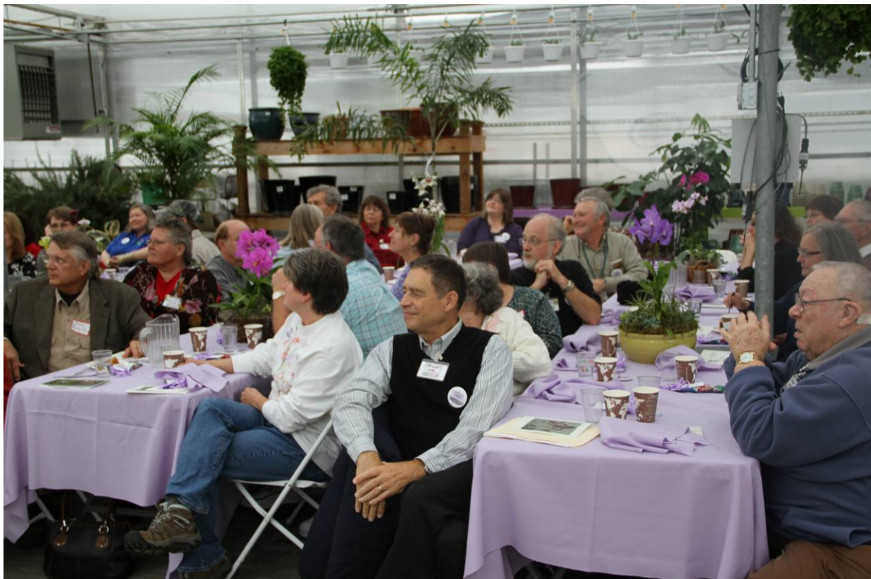
At the banquet celebrating 25th Anniversary of OGG at Orchids Garden Centre & Nursery