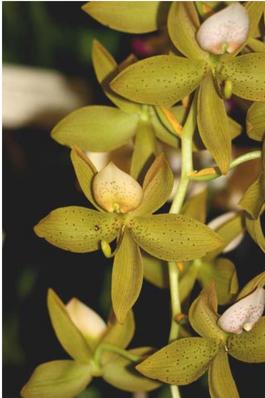
Cynoches loddigesii species grown by Jordan Hawley; Sunset Valley Orchids