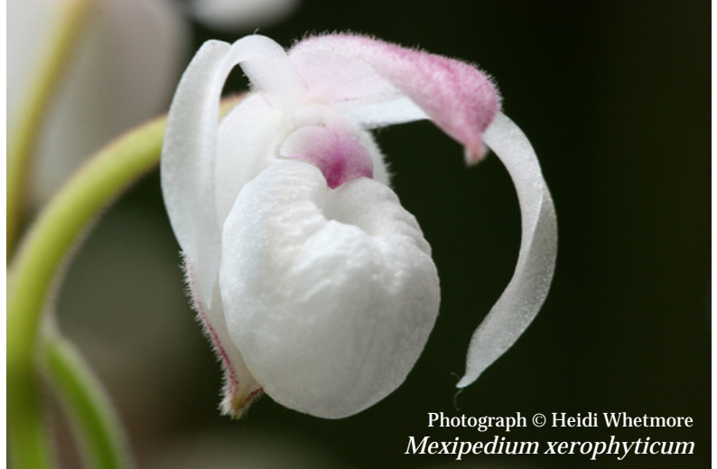
Mexipedium xerophyticum

low and can accommodate the runner's vicarious life-style. An alternative to using Bonsai pots is taping small pots together using waterproof tape, and then filling the pots with mix and New Zealand sphagnum