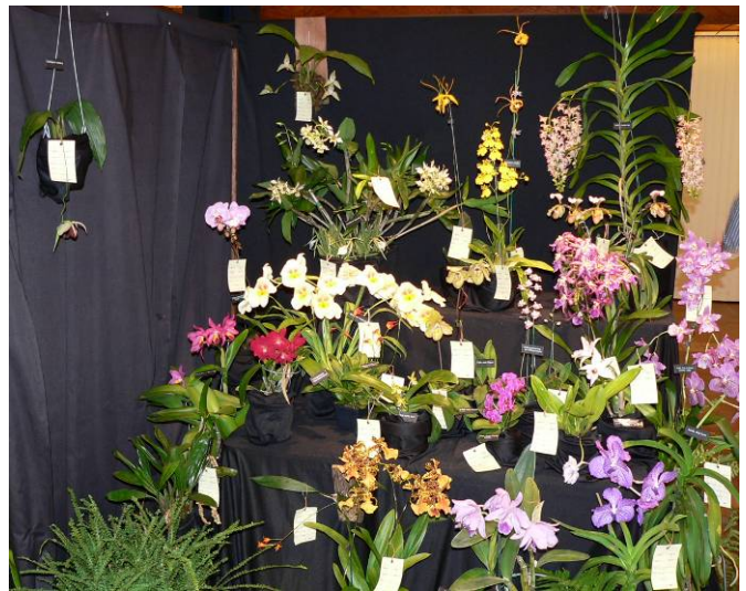
OGG exhibit