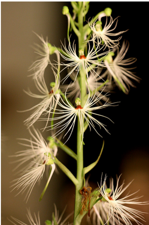
Habenaria medusae species grown by Russ Vernon, New Vision Orchids