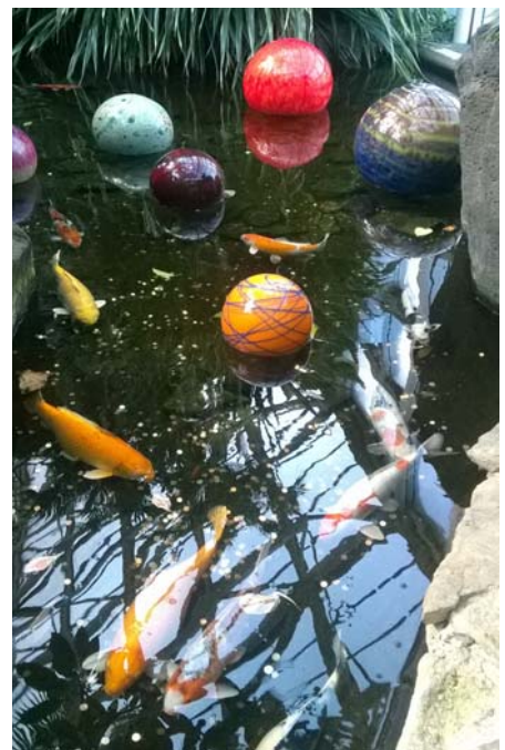
Pond with Fish and decorative balls