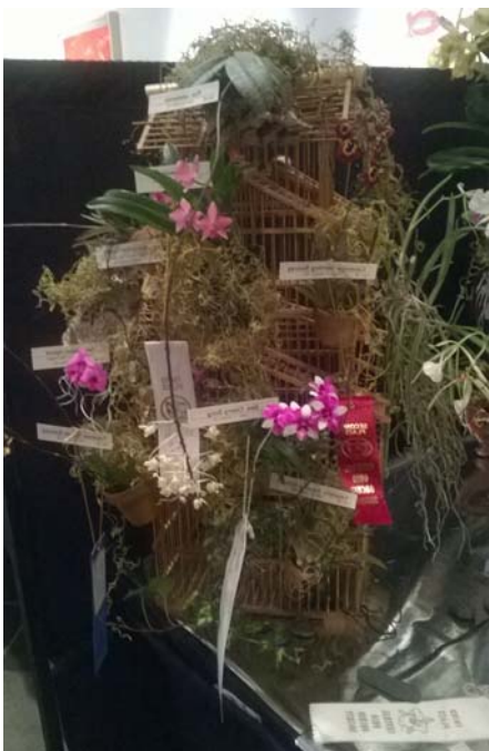
Antique birdcage with orchids

AOS is emphasizing going digital to involve younger people. They have a new application