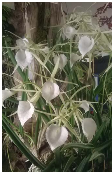
Brassavola grandiflora received HCC/AOS