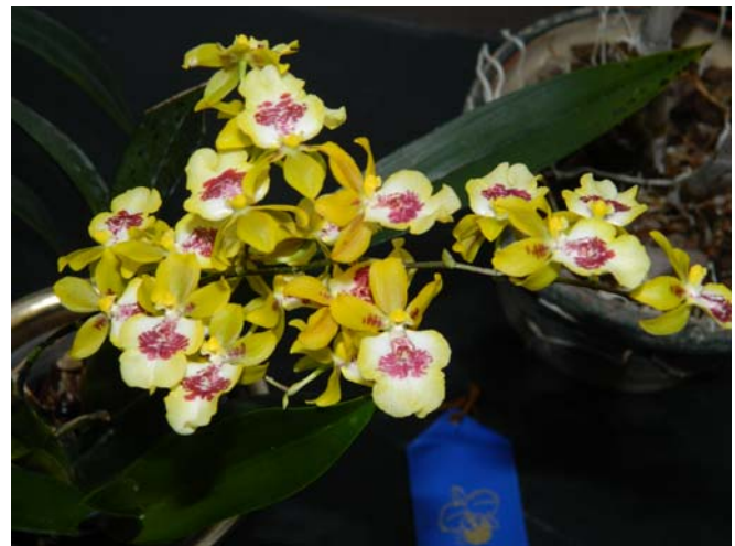
Left is a Lc Acker's Spotlight 'Pink Lady', and an Oncidium Sprite , both grown by Gary Lensmeyer