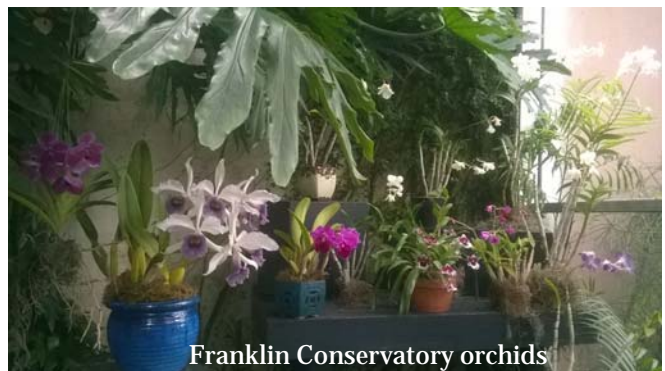
Franklin Conservatory orchids

---Text and photographs by Audrey Lucier, MAOC Liason