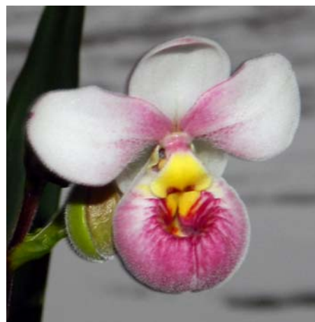
One of the blooms on a Phragmipedium schlimii grown by Audrey Lucier

Rich Narf is our temporary Webmaster. He is working on a different configuration of the OGG website. He is also looking for someone interested in replacing him. Stay tuned!