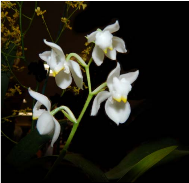
Close-up of Osmoglossum pulchellum , grown by Audrey Lucier