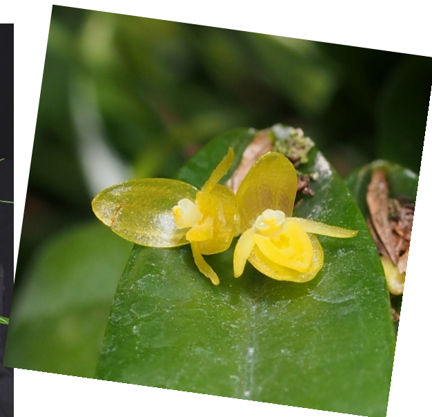
Pleurothallis nephrocardia earned first place, Best of Class and CCM 84 for Olbrich Gardens