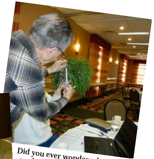
Did you ever wonder what went on during AOS judging? Here one of the judges is measuring something