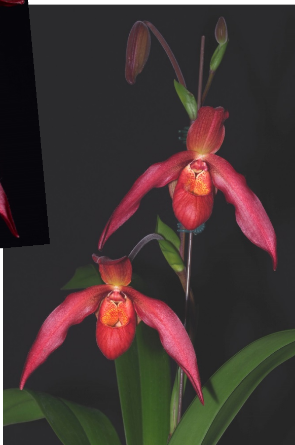
Phrag. Cuzco Blood 'Twin sisters' (Mem. Dick Clements 'Red Glow' HCC/AOS x humboldtii 'Hipp' AM/AOS). Earned first place, Best of Class and AM 81 for Orchid Trading Company