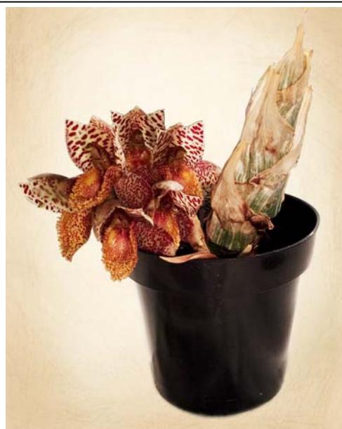
Ctsm. denticulatum ('SVO II' AM/AOS x 'SVO' AM/AOS) grown by Jeff Baylis

The new growths of this Catesium rapidly develop in a five to six month period, bloom, lose their leaves and are dormant for periods from one to five months depending on the climatic conditions. They bear separate male and female flowers with