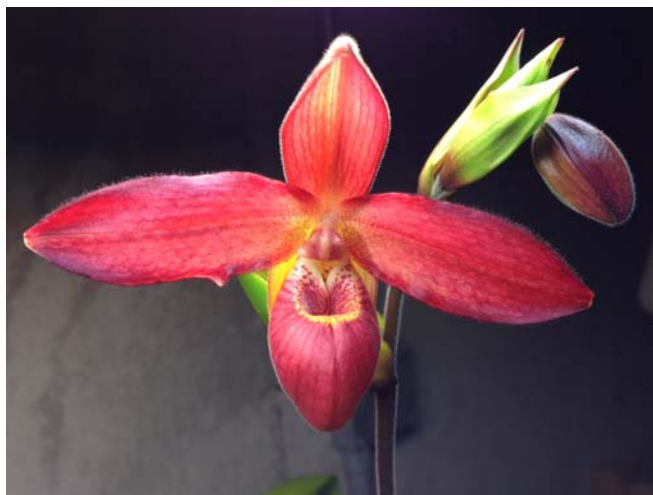
Phragmedidium (Rosalie Dixler)