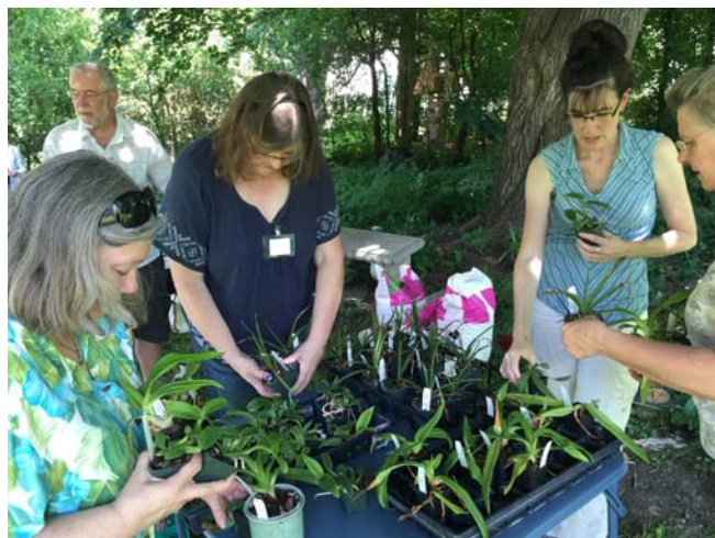
Examining some of the orchid plants looking for new homes

The day was beautiful, attendance was great and the food was delicious and plentiful.