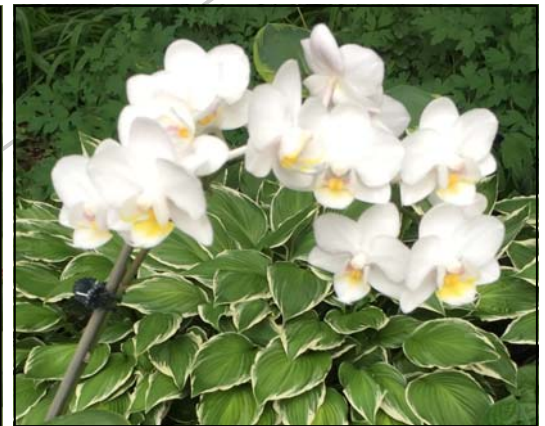
Phalaenopsis Timothy Christoper [white] (Cassandra x aphrodite ) has been an amazing parent in multitudes of multifloral miniature hybrids and today is still one of the most sought-after of all multifloral Phalaenopsis