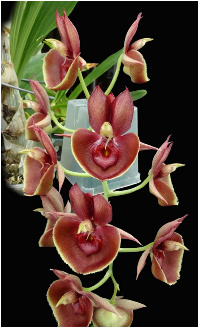
Ctsm. Pontagee Star 'Brian Lawson's Sunrise' HCC x Ctsm. Susan Fuchs 'Burgundy Chips' FCC/AOS. The "pink" [male] version appeared when it bloomed June 29, last year.

When Gary Lensmeyer spoke about Catasetum he mentioned a feature that Catasetum species share with Cycnoches is that they bear separate male and female flowers with occasional intermediate or hermaphroditic forms. The female flowers of all the many species of Catasetum are very similar in shape. It is almost impossible to determine the species from female flowers. The male flowers of Catasetum are highly variable among the