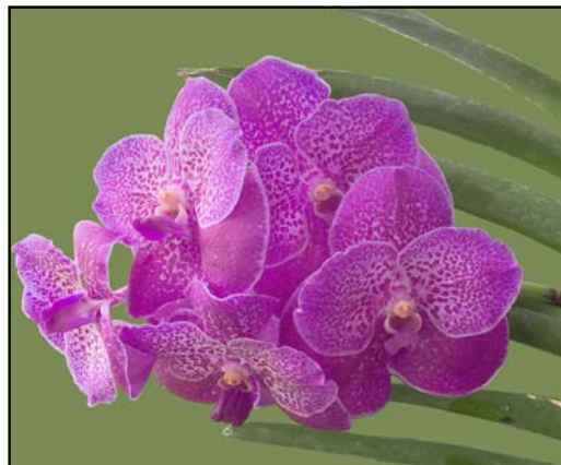
Vanda Chulee Delight, hangs on a curtain rod in an east window. Bruce waters it twice a day and sprays when he remembers