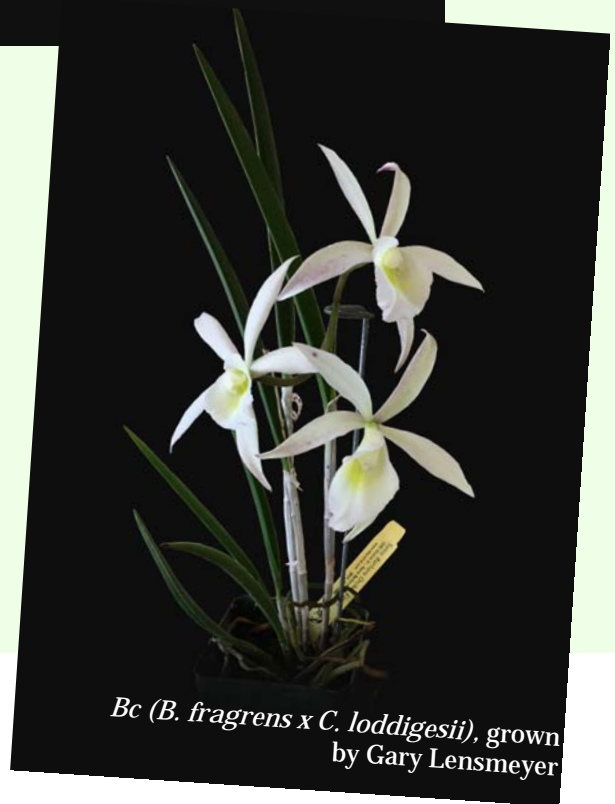
Bc ( B. fragrens x C. loddigesii ), grown by Gary Lensmeyer