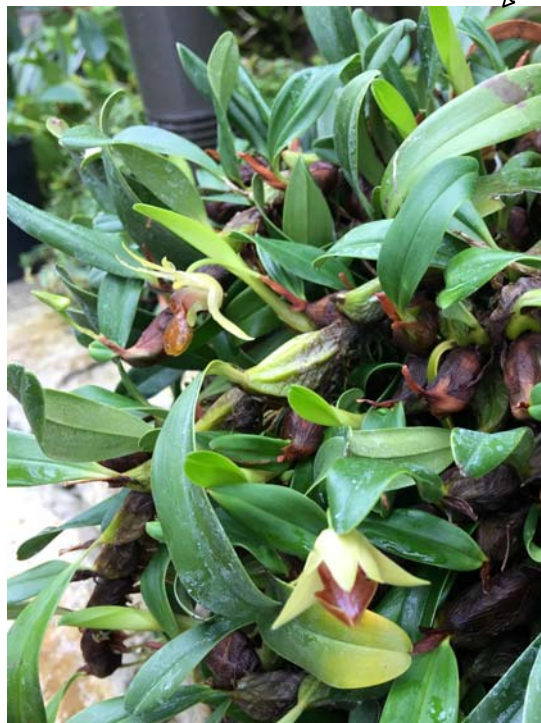
Epigeneium nakaharaei , from Taiwan