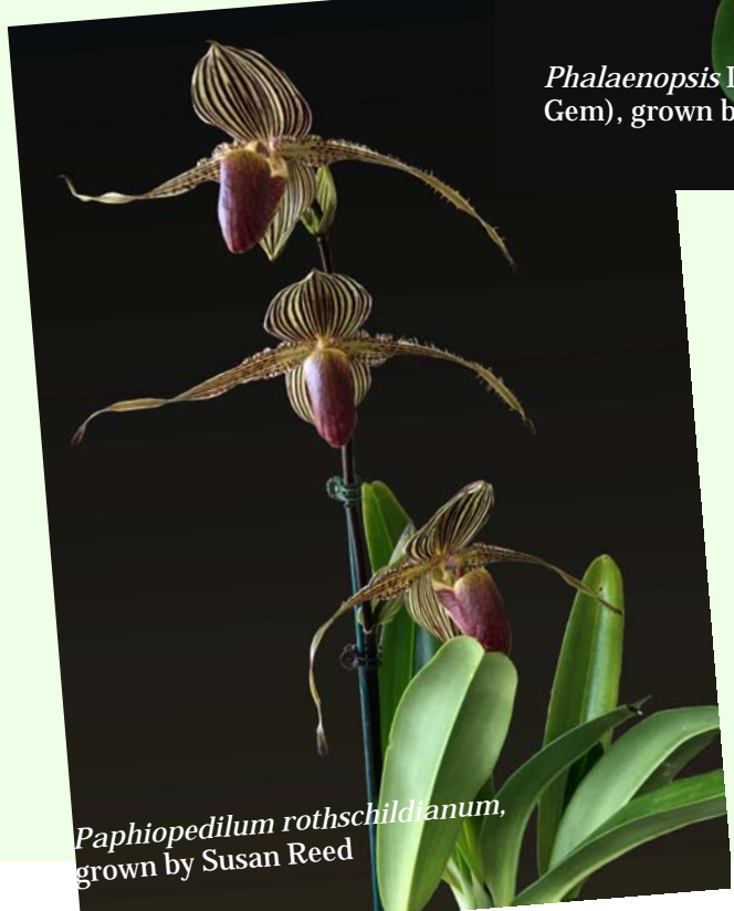
Paphiopedilum rothschildianum , grown by Susan Reed