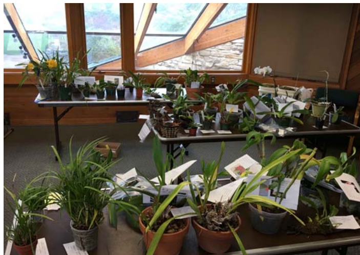
Some of the orchids available at the annual members orchid auction.