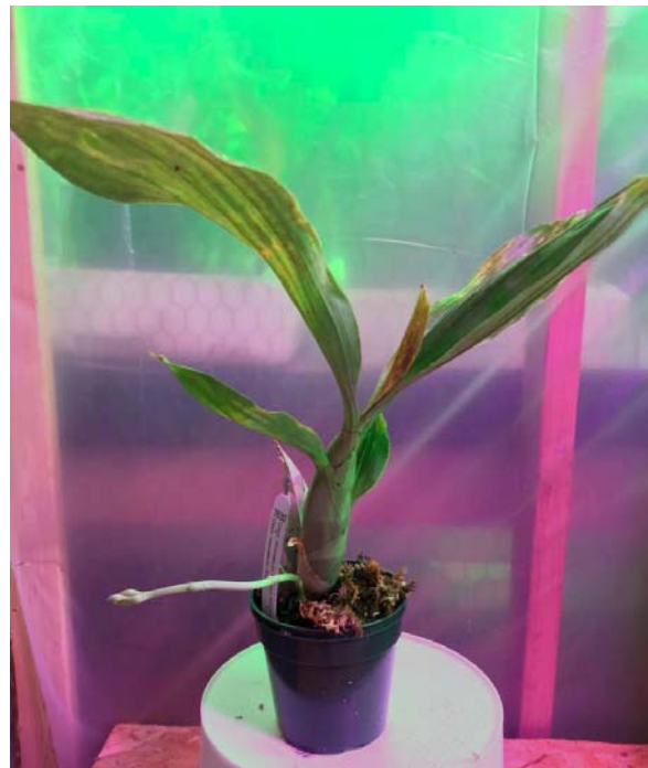
Plant C shows an elongated spike with tight buds.