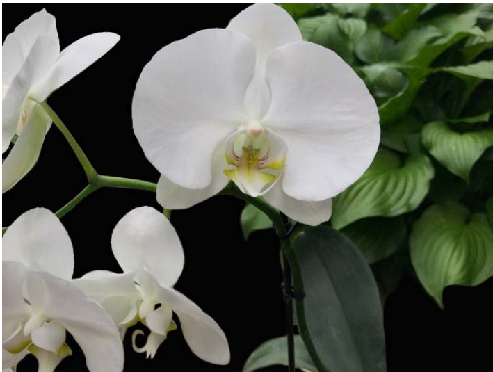
"When this orchid was given to me it was dyed dark blue," Sue Reed