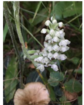
Clockwise from left: Lily-leaved Twayblade ( Liparis liliifolia ), Ragged Fringed Orchid ( Platanthera lacera ), Platanthera flava , Bent stem rattlesnake Plantain and Case's Ladytresses ( Spiranthes casei )