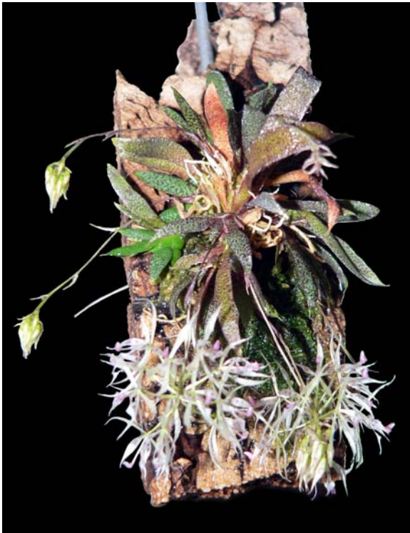
"This Macroclinium aurorae is a small but interesting orchid. After each spike blooms and the blossoms are gone, if you leave the spike on the plant it will rebloom. Fun orchid to watch!" Sandy Delamater