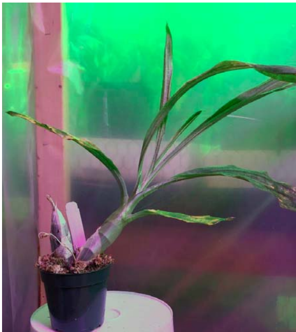
Plant A displays a spike that aborted. See dry stem at base of bulb with leaves. Catasetums can be very forgiving and this plant will most likely send out another flower spike.