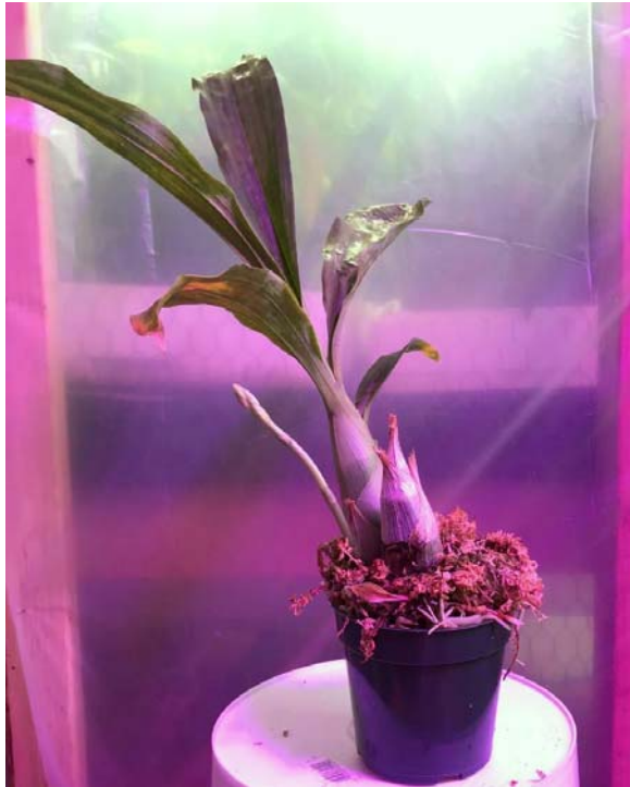
Plant D also shows a spike in tight bud.