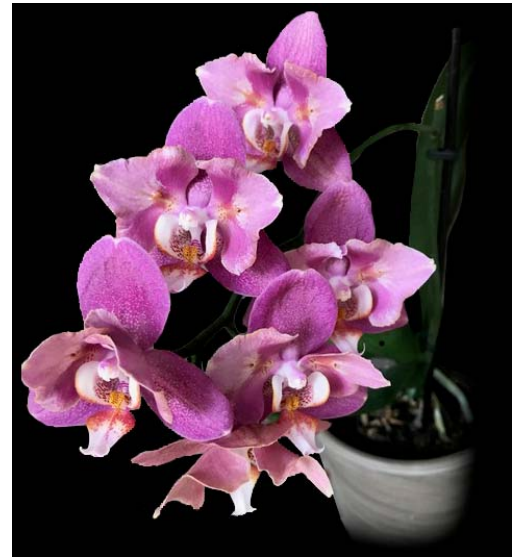
Sue Reed's Phalaenopsis pleroric unknown hybrid