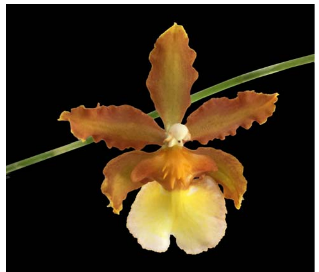
Nancy Thomas' Oncostele Catatante 'Orange Delight' ( Oncidium Sphacetante x Oncostele Wildcat ) (Colmanara). This flower is 2 x 1.75 inches