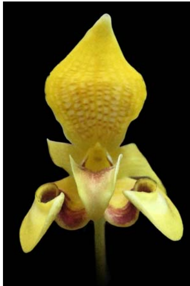
Terri Jozwiak's Bulbophyllum dearei . Also known as "Darth Vader's orchid". Flowers can reach 7 cm in diameter