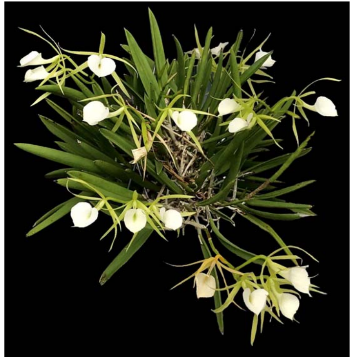
Gary Lensmeyer's Brassavola nodosa

You can access Zoom from your smart phone or any computer, or computer like-system such as iPad. You do not need to sign up for Zoom but you