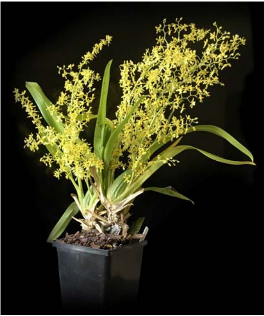
Gary Lensmeyer's Oncidium chrysomorphum is 20 inches tall