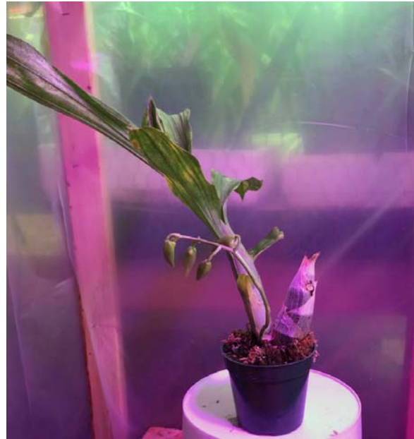
Plant B. Produced a spike with enlarging flower buds

One goal of the project is to observe the diversity in the progeny of a single cross between two catasetums. To illustrate the potential differences, I have included current photos of plants grown by some members. Don't be discouraged if your plant is not spiking yet.