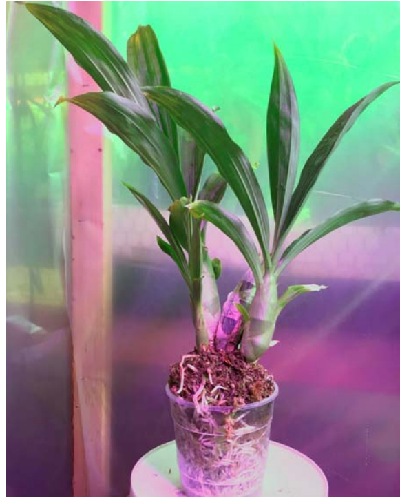
Plant E displays luxurious growth, two pseudo bulbs and has yet to spike.

Questions are always appreciated. glmsnwi@gmail.com . Until next month, Happy growing! Gary