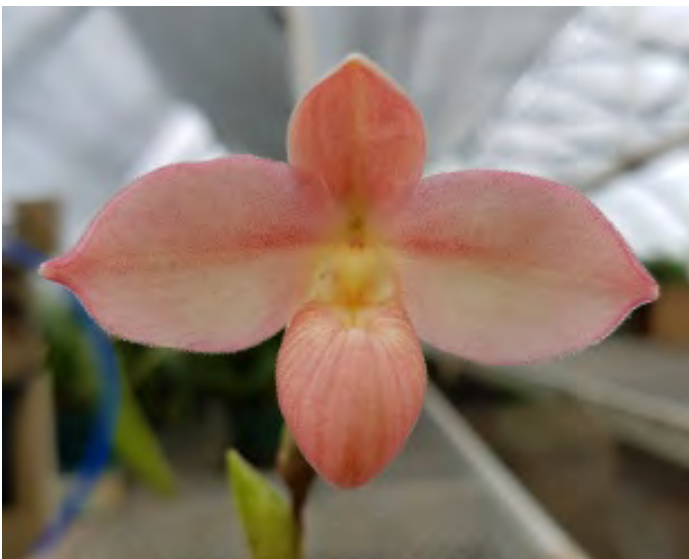
Phragmipedium Acker's Sunbeam (Asuko Fischer x Waunakee Sunset) 2016

North America (three to five years or more) proved to be cost prohibitive. The acquisition cost of blooming size plants for resale was also getting to the level that made it less profitable, and related products were also skyrocketing in price. Not to mention the cost of labor, insurance, maintenance etc. Competition from big box stores, grocery stores and many other chain retailers dramatically affected orchid plant sales of commercial growers all around the country.