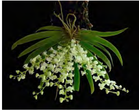
Ornithocephalus inflexus , from Mexico, 5 x 1 1/4" stick, 2nd blooming.