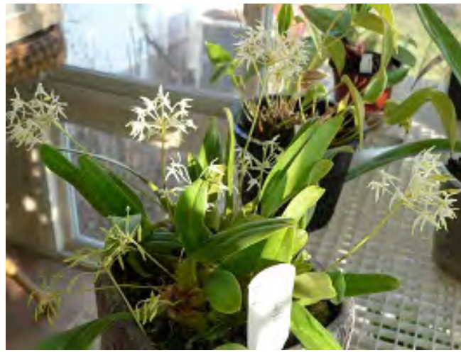
Bulbophyllum laxiflorum , 3rd blooming.