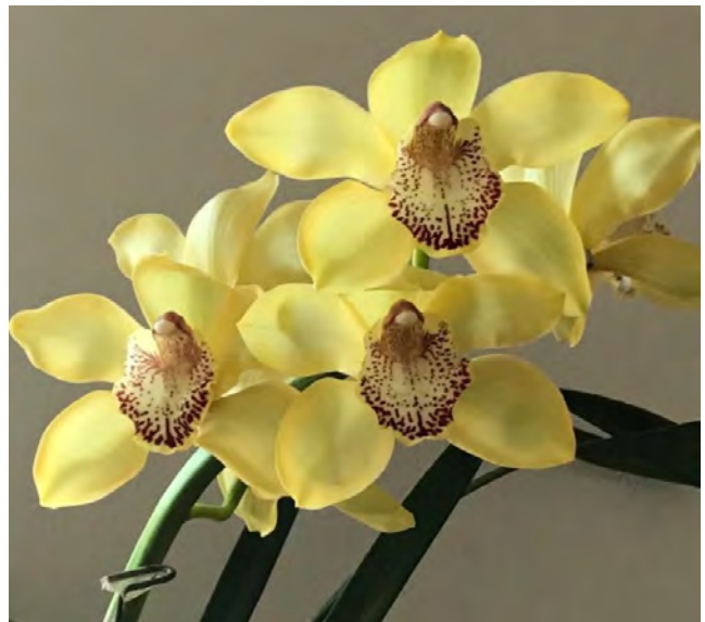
Gary Lensmeyer's Cymbidium Yellow hybrid