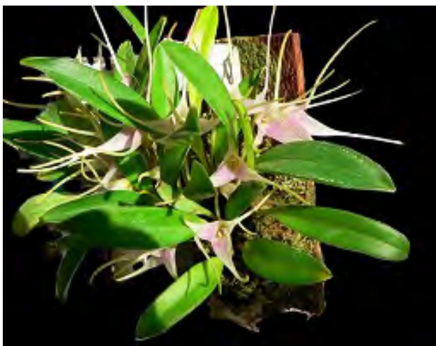
Masdevallia lilacina , from Peru, mounted on a 5"x 3" slab, 42 flowers, second blooming.