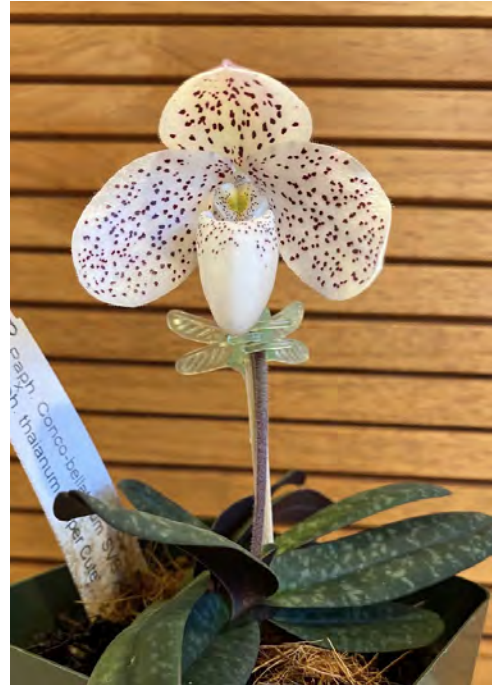
Nancy Thomas also sent a picture of her blooming Paph.

Overall, it appears that this Paph hybrid is slow growing and takes it's good ole time to develop a full flower from when one first observes the emergence of a flower bud in the crevice of the central leaves to the time the flower is fully