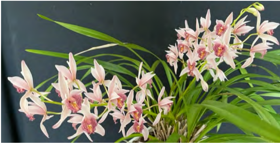
Doug Dowling's Cymbidium Cherry Blossom 'Profusion' ( floribundum x erythrostylum )