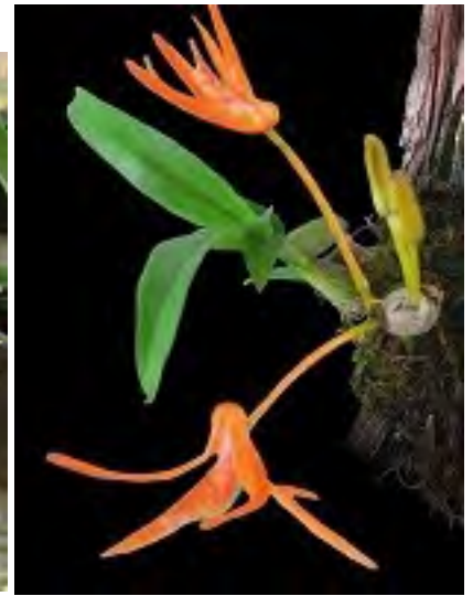
Dendrobium lamyiaiae , - from Thailand, 4 x 1 1/4" stick, first blooming.