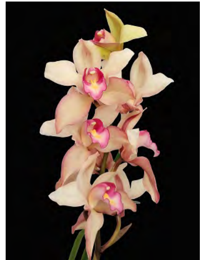
Jeff Metcalf's Cymbidium Point Conception 'Sunset Nativity' ( seidenfadenii x Trigo Royale)