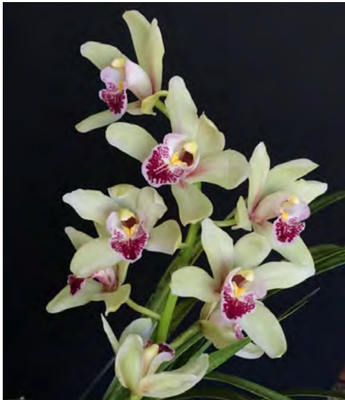
Gary Lensmeyer's Cymbidium White hybrid