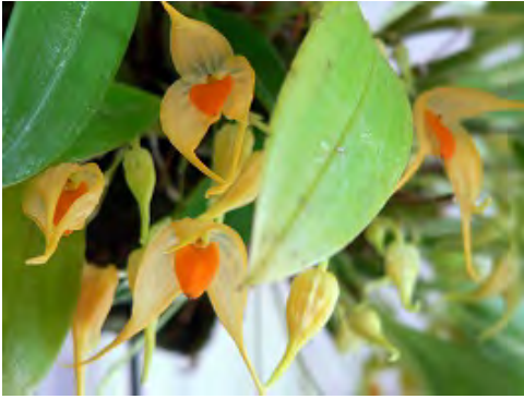
Bulbophyllum ankylochele , from New Guinea, second blooming, 56 flowers, mounted on a 5 1/4 x 3 1/4" slab.