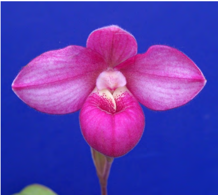
Phragmipedium Acker's Ballerina (Icho Tower x fischeri) 2012