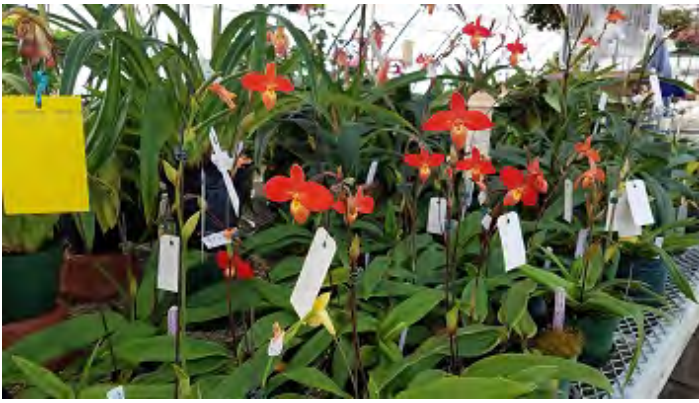
The besseae collection