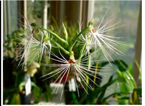
Habenaria medusa , - ten years old, has bloomed every year.