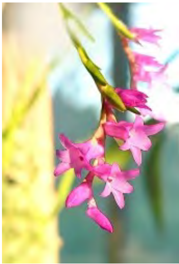
Isochilus linearis , from Mexico, mounted on a 9"x 4" slab, second blooming.