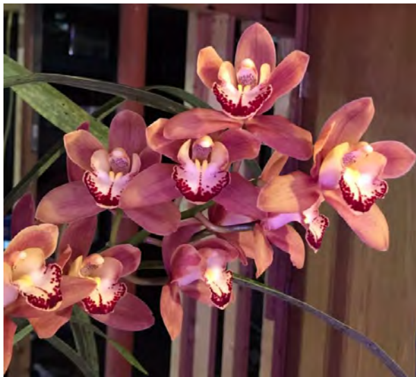
Gary Lensmeyer's Cymbidium Red hybrid