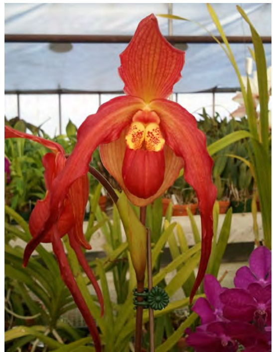
Phragmipedium Acker's Dragon (Twilight x humboldtii) 2012

Before my last day of employment, I had moved my personal collection of some 400 Paphiopedilum and Phragmipedium (that I had amassed