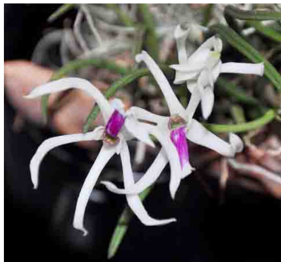
Keith Nelson's Leptodes bicolor (Leptotes, from the Greek for delicateness) is from a group of small to miniature species all remaining under about 8" in height that can be grown mounted or potted.

Rather than discussing crosses selected for size, Kristen focused on miniature species. She described Dendrobium kingianum , a small to large sized, cool to warm growing orchid, originating from Queensland and New South Wales, Australia. It is found near the coast and in the mountains growing lithophytically on rocks and cliff faces and can form dense mats. The species has a wide degree of