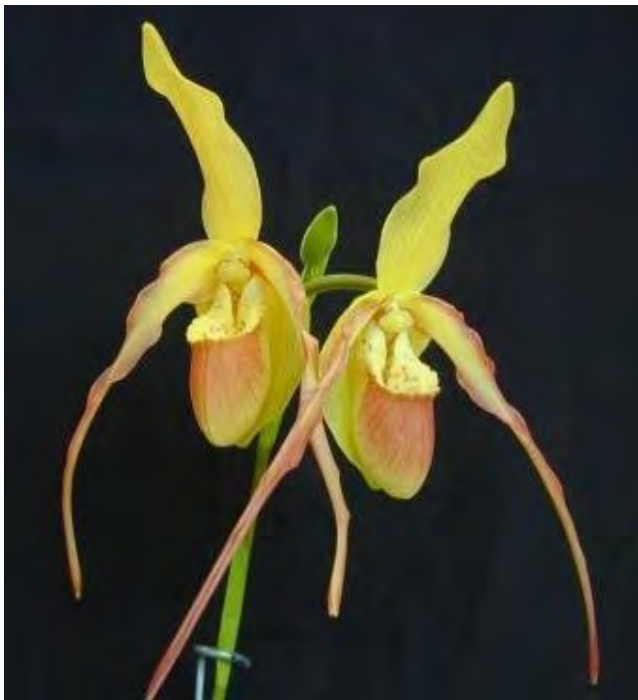
Phragmipedium Acker's Sunstar (Don Wimber x wallisii ) 2005

In the years following the change of ownership, the orchid side of the business saw many challenges. We witnessed a decline in orchid plant sales and watched several long-standing orchid businesses in the area and around the country closing their doors or downsizing. The expense and time needed to raise orchids from flask in