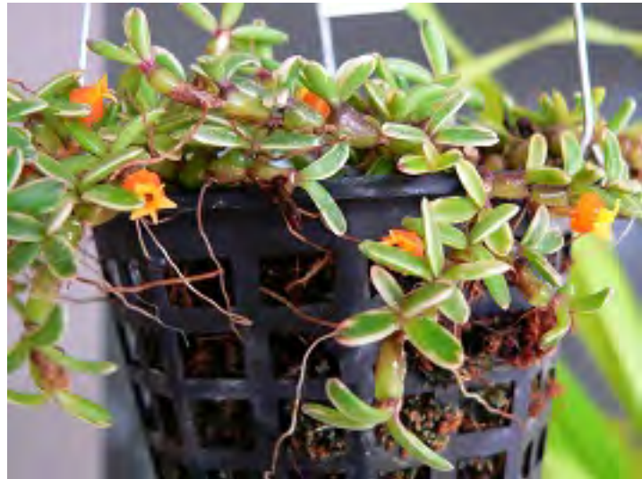
Mediocalcar decoratum , variegated, from New Guinea, first blooming, 4" basket w/moss.