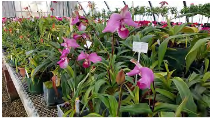
The kovachii collection