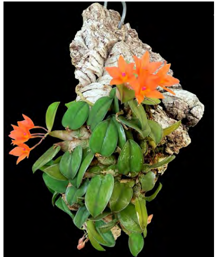
Sandy Delamater's Sophronitis (Catt.) cernua

Dendrobium nobile 's profuse, beautiful, delicately scented flowers produce a wonderful display for up to several months at a time. Dendrobium bellatulum is a mini-miniature sized, warm to cold growing epiphyte with fragrant, long-lasting flowers held close to the pseudobulb. The flowers are large in relation to the size of the whole plant.