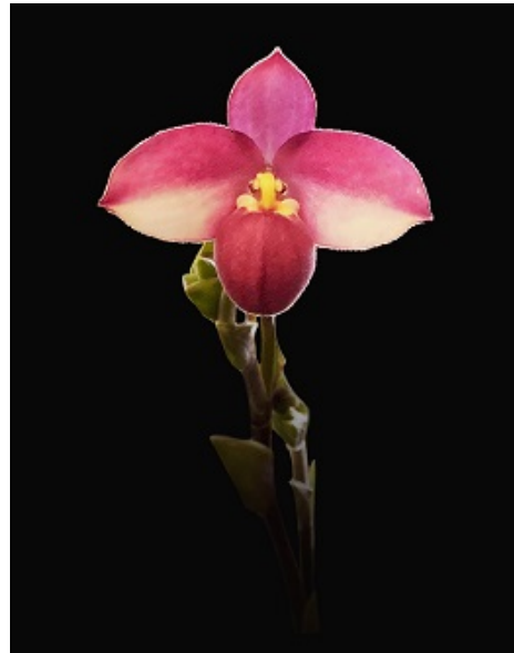
Chuck Acker's Phrag Acker's Rose River (Inca Rose x Fall River)