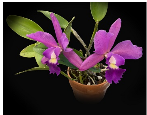
Ken Cameron's Lc Acker's Spotlight 'Pink Lady' (C. aclandiae x Lc. Acker's Madison) registered cross in 1988, bi-foliolate growth, somewhat compact in stature, extremely fragrant flowers and blooms several times a year when not divided.