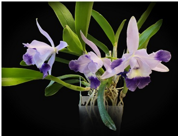
Sandra Gray's Cattleya Cariad's Mini-Quinee 'Angel Kiss' (Mini Purple x intermedia )