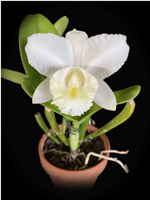
Cattleya Acker's Angel (Lodgen x Little Angel)

I move my plants back indoors when temperatures once again reach the 50's and 60's (with the occasional 40 degree night thrown in). The Cattleyas go back to the South window where Acker's Cattleya Acker's Angel was placed until I noticed that the bud had opened on October 23rd. It will be making its debut at the Eastern Iowa Orchid Society show the weekend of October 28 and 29.