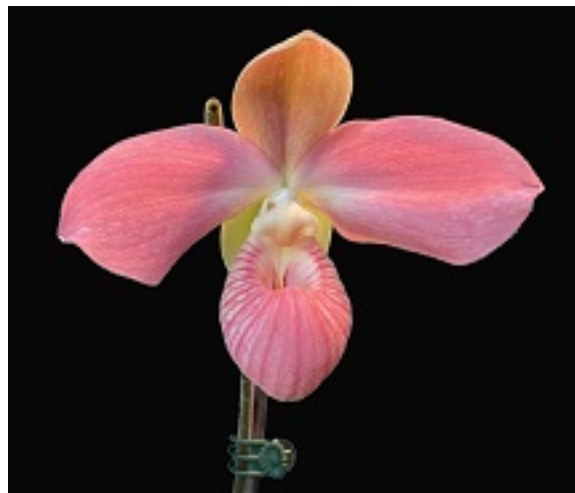
Lorraine Snyder's Phrag. Peruflora's Cirila Alca. ( kovachii x dalessandroi )