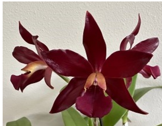
Nancy Thomas' Cattleya Chocolate Drop 'Volcano Queen'

Orchid web : ... is native to Borneo and can be found growing on limestone outcrops. This is an intermediate to warm temperature plant that likes shady conditions and doesn't mind some calcium and magnesium in the water. This is perhaps one of the most magnificent of the multi-floral species with large flowers that last about six weeks. It takes many years to grow these to flowering size and these rare plants have been grown from seed since 2008.