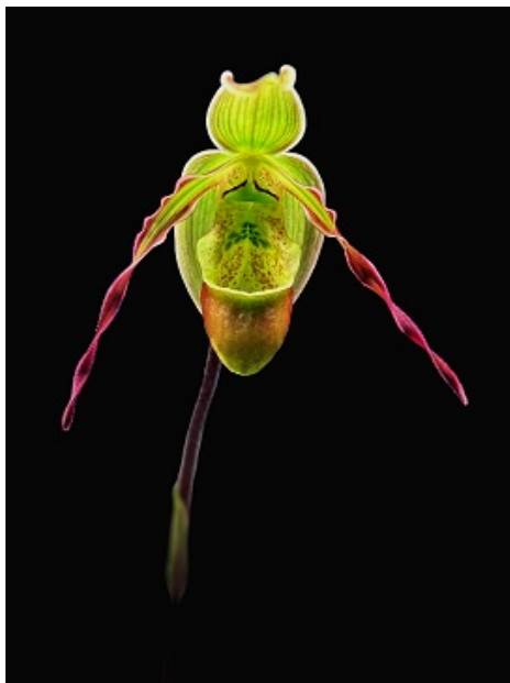
Phrag Conchiferum ( caricinum × longifolium , old cross from 1881). No ribbon in Milwaukee

Sue Reed grows these under LED lights in the basement. The temperature never goes above mid 70's and not below mid 60's. The Diplocaulobium pulvilliferum is kept constantly wet.