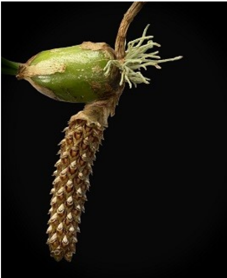
Gary Lensmeyer's Bulbophyllum crassipes