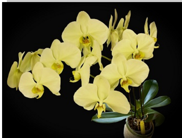
Meg McLaughlin's Phalaenopsis Star Green Beauty 'M251' (Ming Hsing Moonlight x Golden Apollon) appears to be yellow in this photo but it is actually a pale green