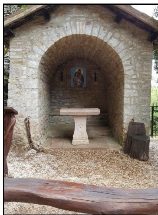
Prayer Altar in forest where Saint Francis of Assisi lived

Co-Sponsors will be announced at later date