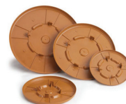
SPA08000, SPA10000, SPA12000