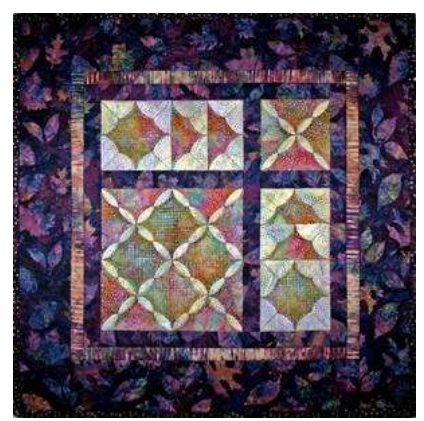
Cathedral Windows Sampler - February