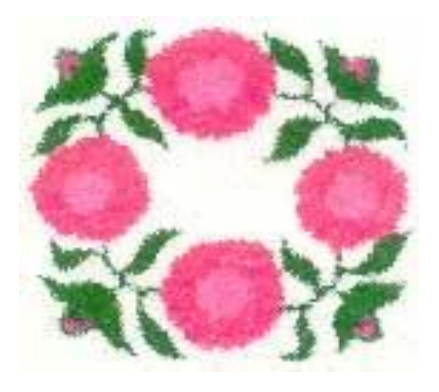
Check out our website: <u>www.scvquiltguild.org</u> WOW! See the newsletter online!

Thursday, August 18<sup>th</sup>, 6:30 PM Business Meeting – Newhall Public Library