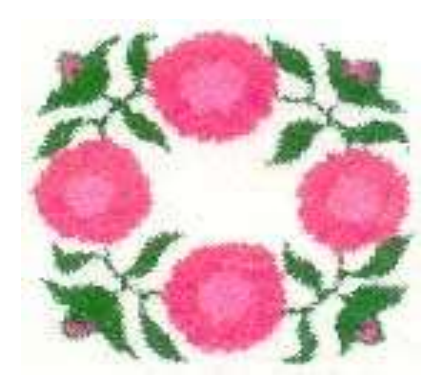
Check out our website: www.scvquiltguild.org WOW! See the newsletter online!

Santa Clarita Valley Quilt Guild P.O. Box 802863 Santa Clarita, CA 91380-2863