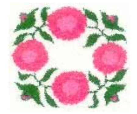
Check out our website: <a href="https://www.scvquiltguild.org">www.scvquiltguild.org</a> WOW! See the newsletter online!

May 15, 2014, 6:30 PM Business Meeting Newhall Library, Heritage Room