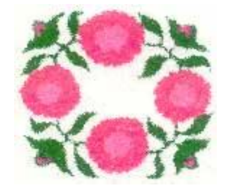
Check out our website: <a href="https://www.scvquiltguild.org">www.scvquiltguild.org</a> WOW! See the newsletter online!

June 19, 2014, 6:30 PM Business Meeting Newhall Library, Heritage Room