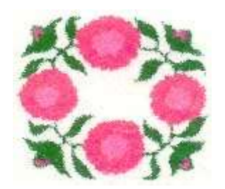
Check out our website: <a href="https://www.scvquiltguild.org">www.scvquiltguild.org</a> WOW! See the newsletter online!

Santa Clarita Valley Quilt Guild P.O. Box 802863 Santa Clarita, CA 91380-2863