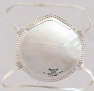
■ 02255 CE FFP1, FFP2, FFP3 (02255D: With Dolomite Filter)