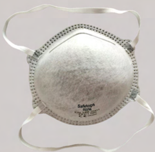
■ 02256 CE FFP1, FFP2, FFP3 (02256D: With Dolomite Filter)