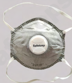
■ 02252V CE FFP1, FFP2, FFP3