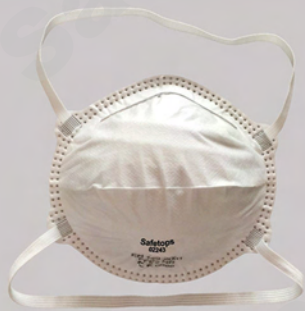
■ 02243 CE FFP1, FFP2, FFP3