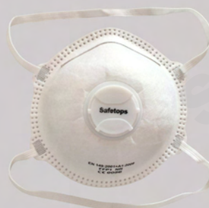
■ 02255V CE FFP1, FFP2, FFP3 (02255DV: With Dolomite Filter)