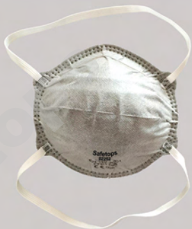
■ 02252 CE FFP1, FFP2, FFP3