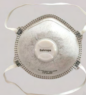
■ 02256V CE FFP1, FFP2, FFP3 (02256DV: With Dolomite Filter)