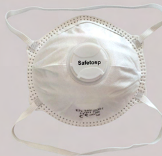
■ 02243V CE FFP1, FFP2, FFP3