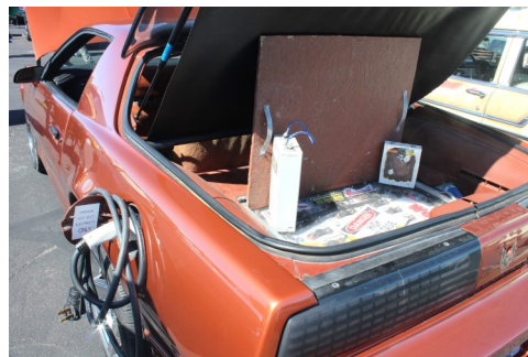
A car converted to "electric"