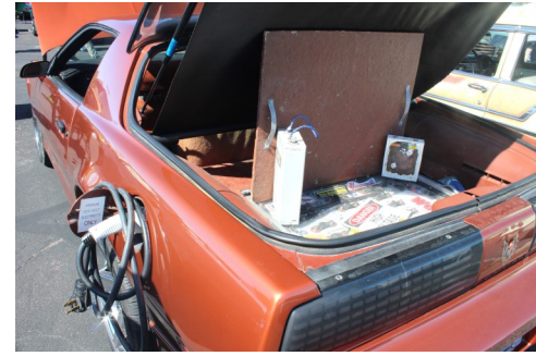
A car converted to "electric"