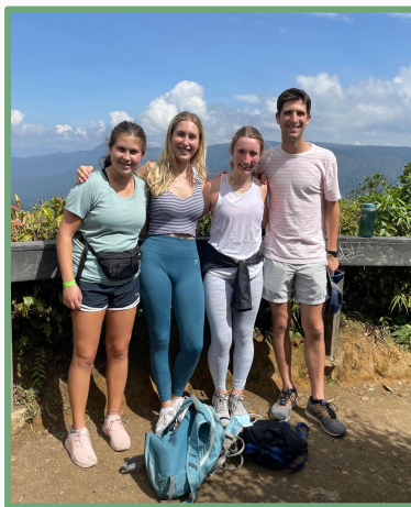
Spanish Immersion + Travel in Costa Rica.