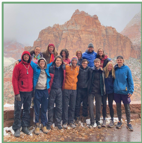
Wilderness + Conservation Program in the U.S.