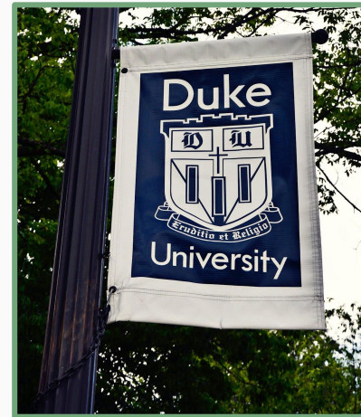
Off to Duke!