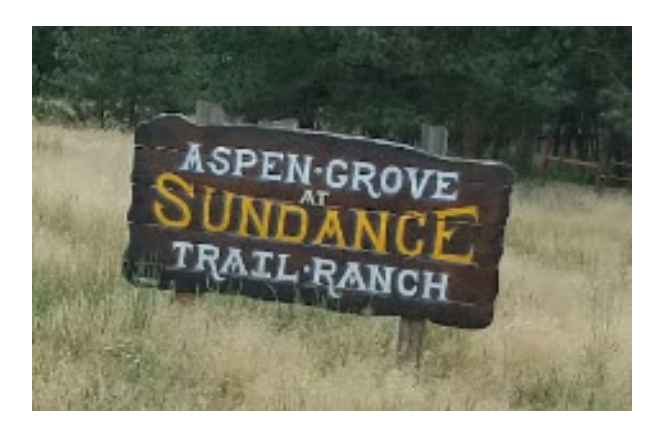
Sundance Trail Ranch sign visible from CR 74E - Red Feather Lakes Road

If you have not ridden at Sundance Trail Guest Ranch, you have missed a fabulous ride. If you have ridden there before, you will agree that it is a splendid place to ride.