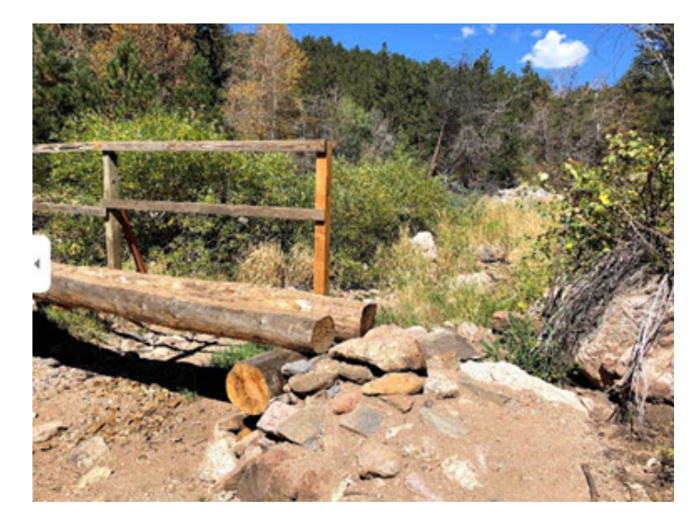
The first bridge is for hikers. Don't worry, horses cross the river in a nearby ford.