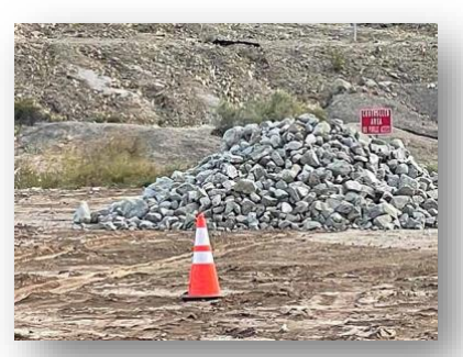
The first of many piles of rocks

Large trucks have started hauling in Rip Rap and are dumping it East of the entry gate next to the chip seal cover. The actual digging and grading will begin around the first week in April and is scheduled to be completed by December 2021.