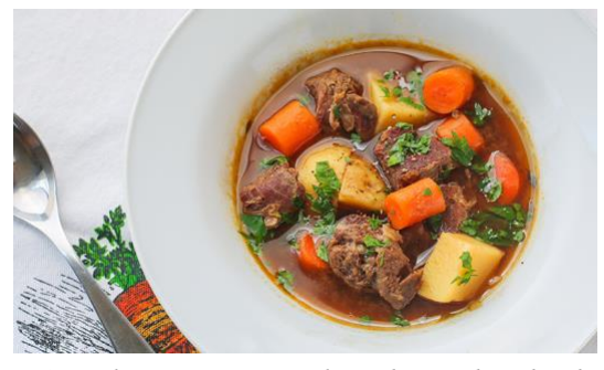
Serve this venison stew with good crusty bread and your favorite stout beer. Most bars don't serve food this good.

Mmmmmmmm... Carrots, potatoes and venison stew meat. Feast on this classic stew recipe with an extra draught of flavor: the full, coffee-like aroma of a dark stout beer. This hot, filling meal will melt any chill after a long day of hunting, working or playing outside. And as with any stew, it tastes even better when prepared