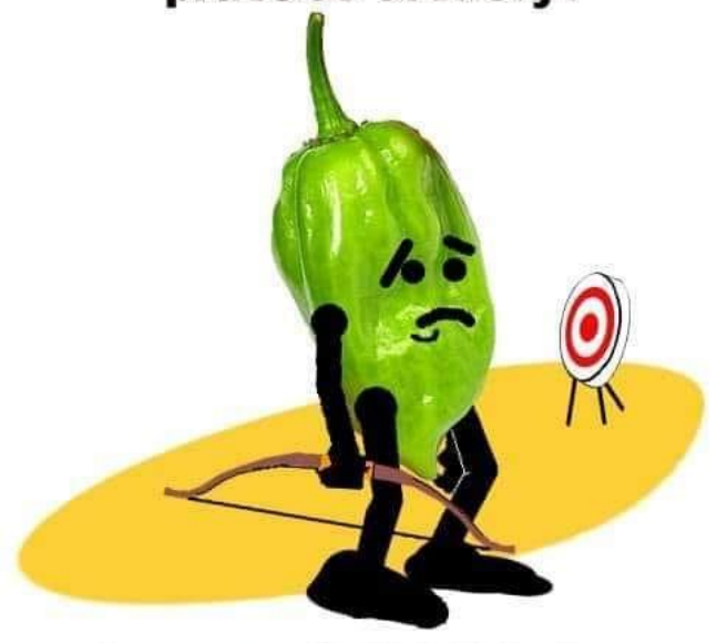
...because it didn't habanero