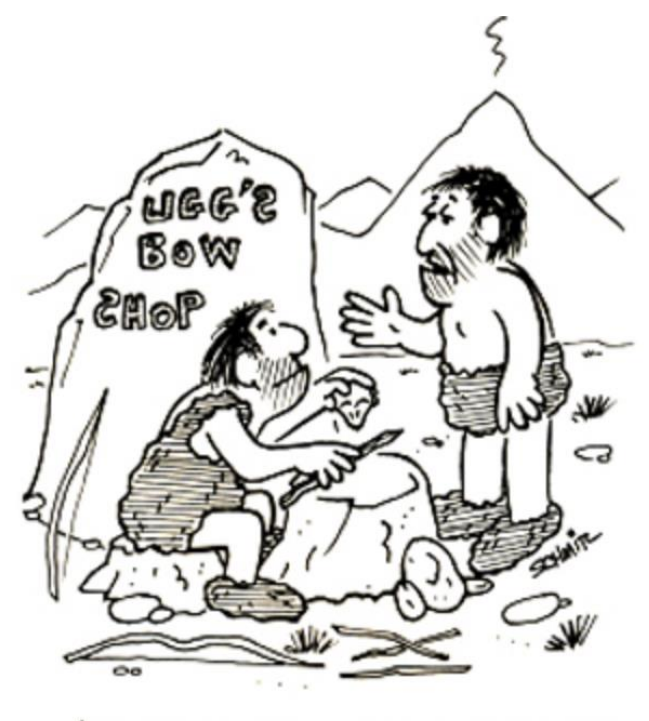
"I'D LIKE TO SEE SOMETHING IN YOUR LINE OF TORQUE-STABILIZED, LAMINATED, FIBERGLASS PROFESSIONAL HUNTING BOWS."