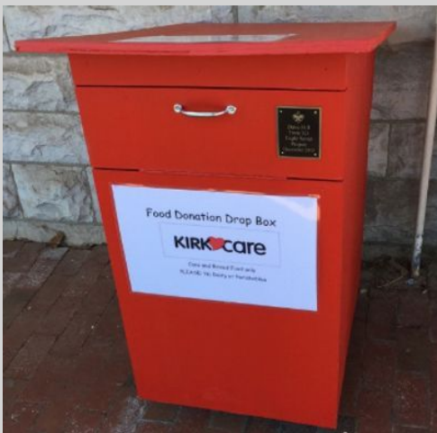
Kirk Care Drop Box