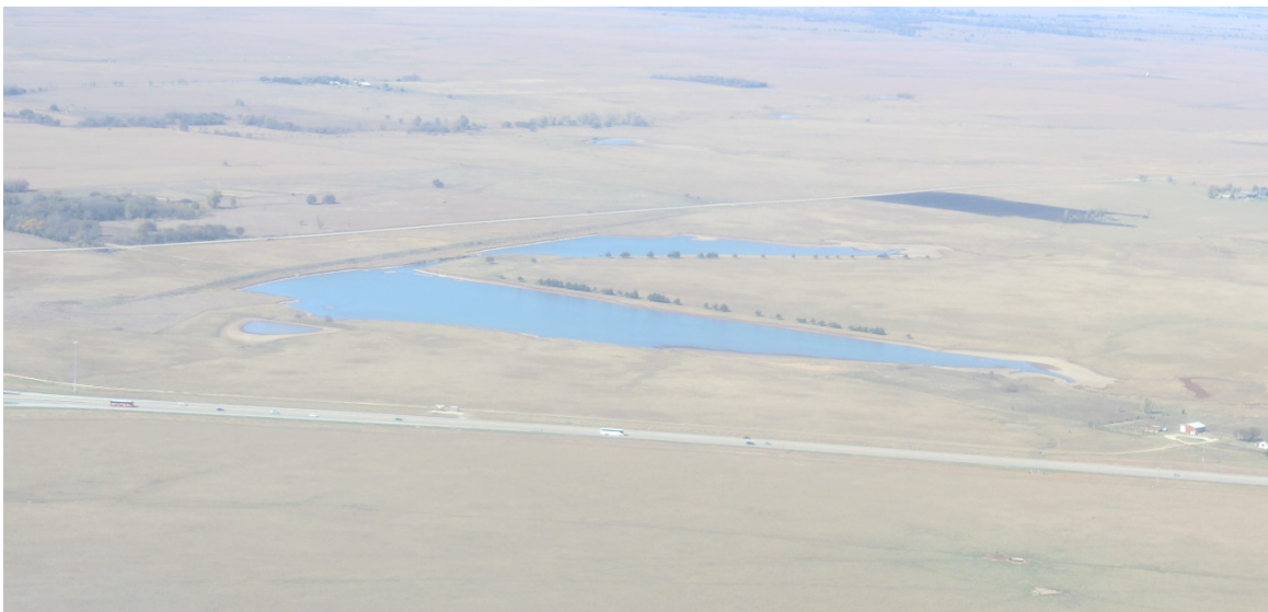
An Upper Walnut Watershed dam can be seen west of the Kansas Turnpike just north of the Cassoday Interchange

Karen A. Woodrich, State Conservationist, said, "These dams are out there performing a function that goes largely unnoticed, but when we receive high intensity rainfalls like we have had recently, they function and quietly do their job of slowing down flood flows."