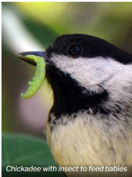
Chickadee with insect to feed babies