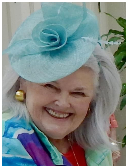
Artistic Crafts ~ Fascinator Hat

There are five Divisions possible for a Flower Show: Horticulture, Design, Education, Youth and Sponsored Groups, and Botanical Arts. The "Schedule" outlines all elements of a flower show as the Law of the show.