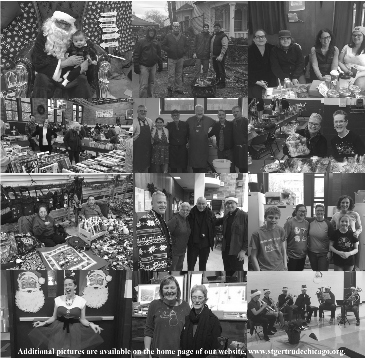
Additional pictures are available on the home page of our website, www.stgertrudechicago.org .