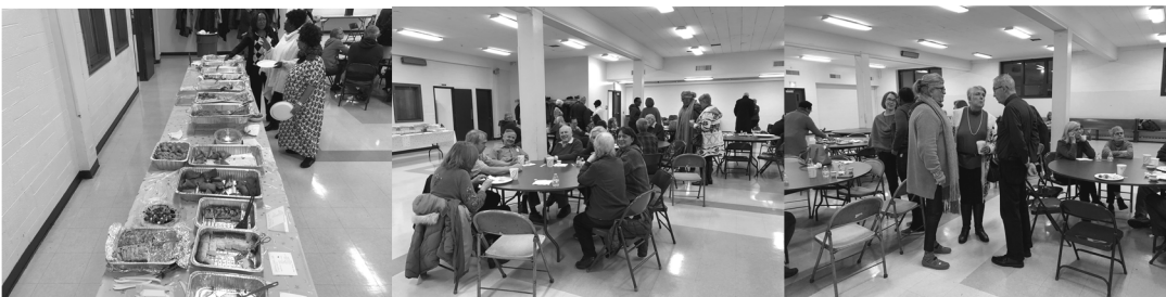
Images of the International Dinner, celebrated on Friday, November 9 courtesy of Roy Lipscomb.

This Saturday is the Feast of the Immaculate Conception of our Blessed Mother and a Holy Day of Obligation . This is also the National Feast Day of the United States. Please join us for Mass on Saturday morning at 7:30 am.