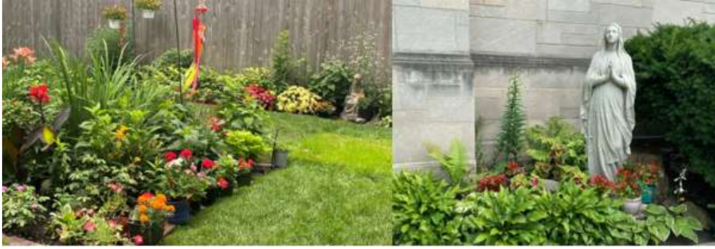
The Rectory garden.