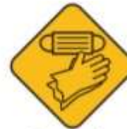
Face Masks & Gloves

Click here or the image above for a PDF of the flyer for the October 3 event.