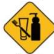
Personal Hygiene Items