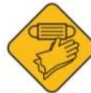
Face Masks & Gloves

Click here or the image above for a PDF of the flyer for the October 3 event.