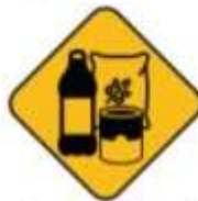
Canned & Boxed Food/Beverage