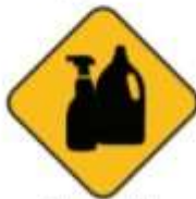
Household Cleaning Items

To maintain social distancing donations should be placed in the car trunk. Volunteers wearing face masks and gloves will remove items. Walk-up donations also welcome.