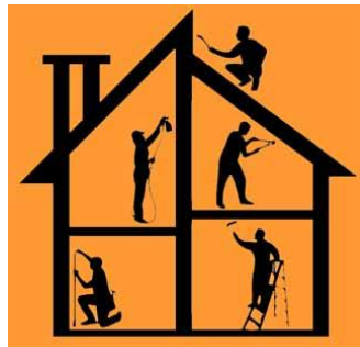
Owner Occupied Housing Rehab.

It is anticipated that financing will be Conditional Grants. You may be required to pay back a portion if you do not live in the home as your primary residence for at least 5 years.