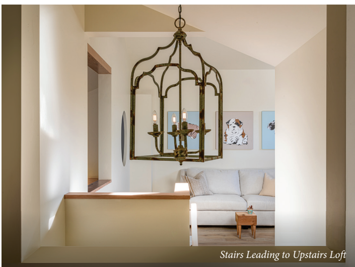
Stairs Leading to Upstairs Loft

5 BEDS, 5.5 BATHS ■ 3,589 SQ. FT. ■ $5,850,000 ■ 2884LASAUEMROAD.COM