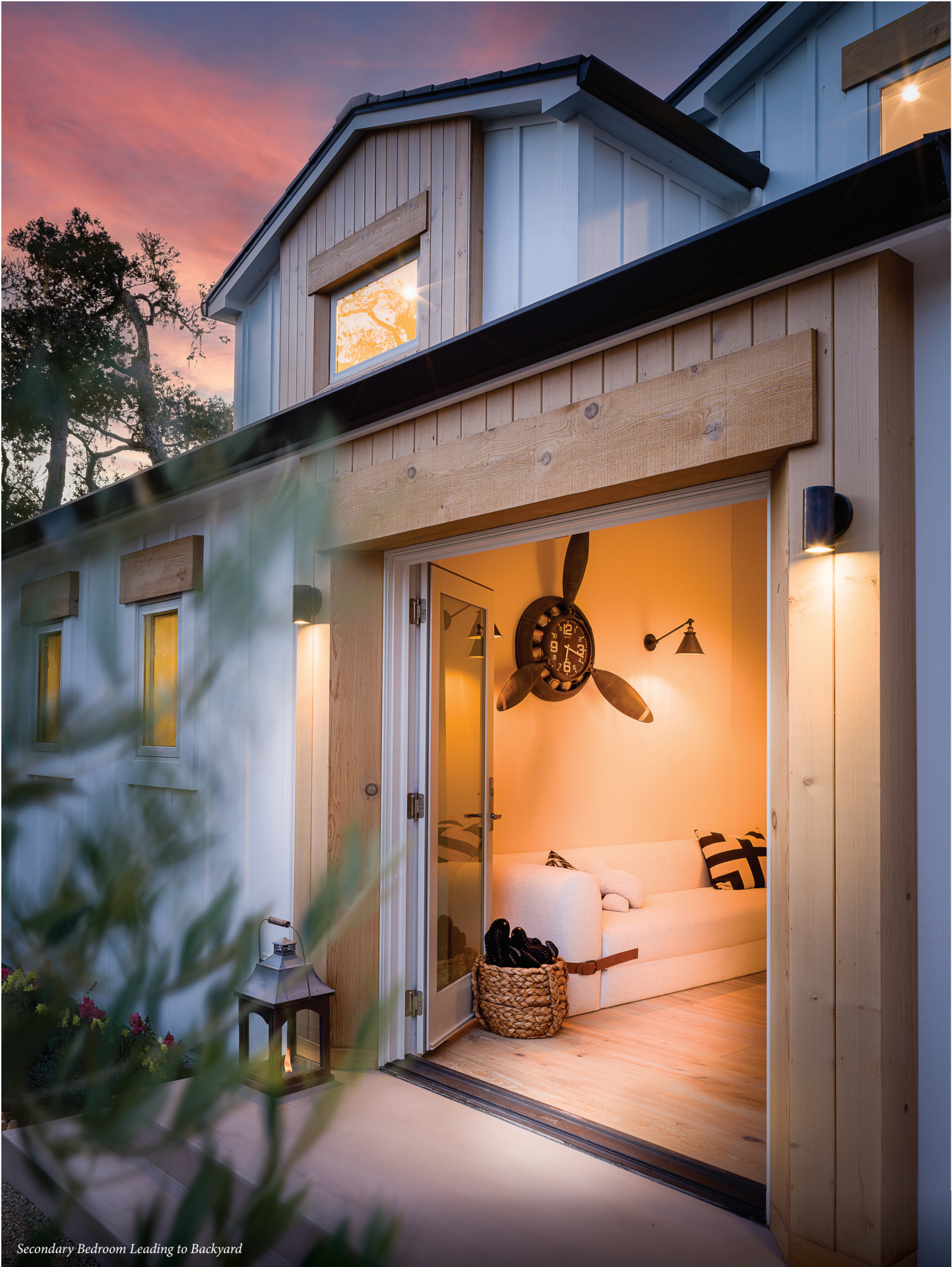
Secondary Bedroom Leading to Backyard