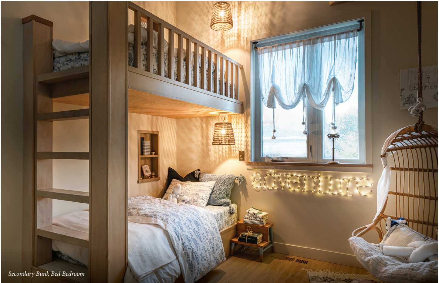
Secondary Bunk Bed Bedroom