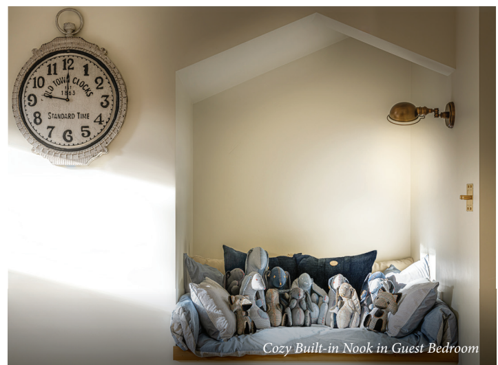
Cozy Built-in Nook in Guest Bedroom