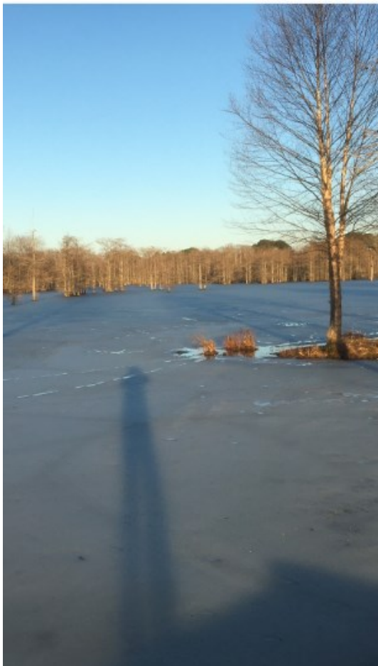
Birds on ice