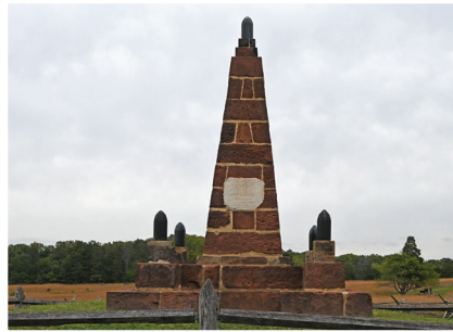
Union Memorial for soldiers that died at Battle of First Bull Run. Located on Henry Hill at Manassas, VA.

I love history and visiting historical places I have never been to before. While in High School, I even considered becoming a history teacher. I believe teaching history can help us better understand who we are and our society. Recently, I went to Manassas to tour the Battle of Bull Run. Shortly after the American Civil War, in