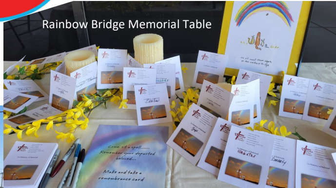
Rainbow Bridge Memorial Table