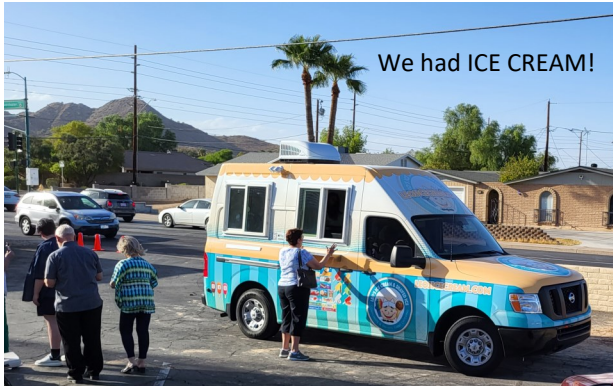
We had ICE CREAM!