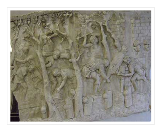
Roman soldiers felling trees for construction purposes. Detail Trajan's Column.

...the trees and forests were supposed to be the supreme gift bestowed by her on man. These first provided him with food, their foliage carpeted his cave and their bark served him for aliment.<sup>9</sup>