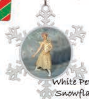
White Pewter Snowflake

Other Background options available upon request.