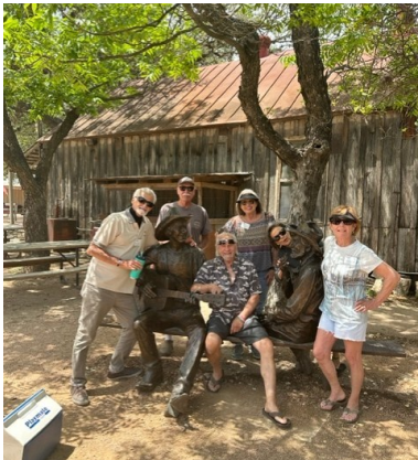
With Willie and Waylon and the boys