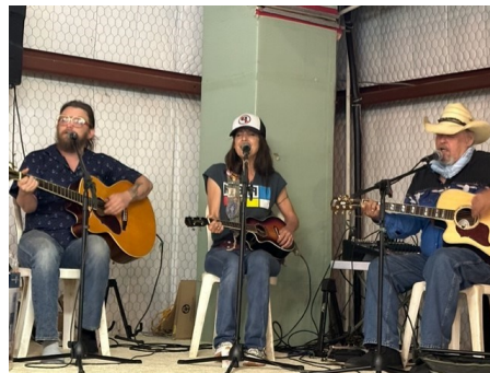
After Dinner Entertainment