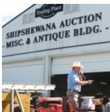
Weekly Antique Auction

Our Fall 2016 rally will be in Goshen, Indiana. Some events around our rally time can be found at visitindiana.com