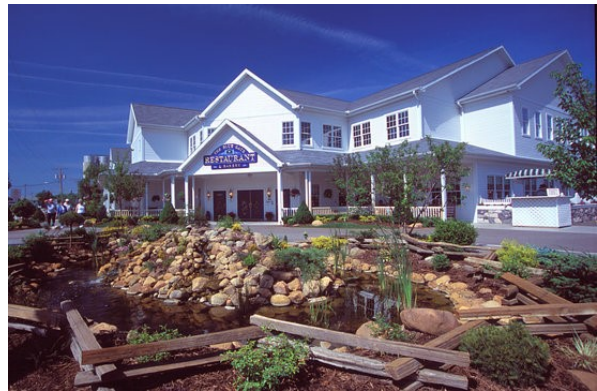
Blue Gate Theater

These and more good stuff can be found at the above link. The theater has some very interesting shows.