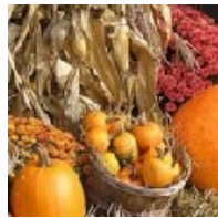
Fall Crafters Fair