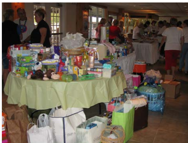
The MA Ladies are always generous!