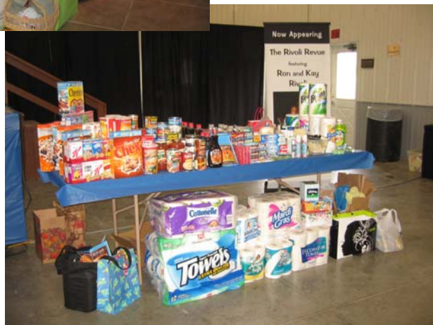
Ladies Tea donations from the Beth Page and Amana Colonies Rallies!