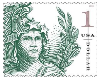
Statue of Freedom*

*The following philatelic information was obtained from the U.S. Postal Service, for more information on New Issues please visit: usps.com