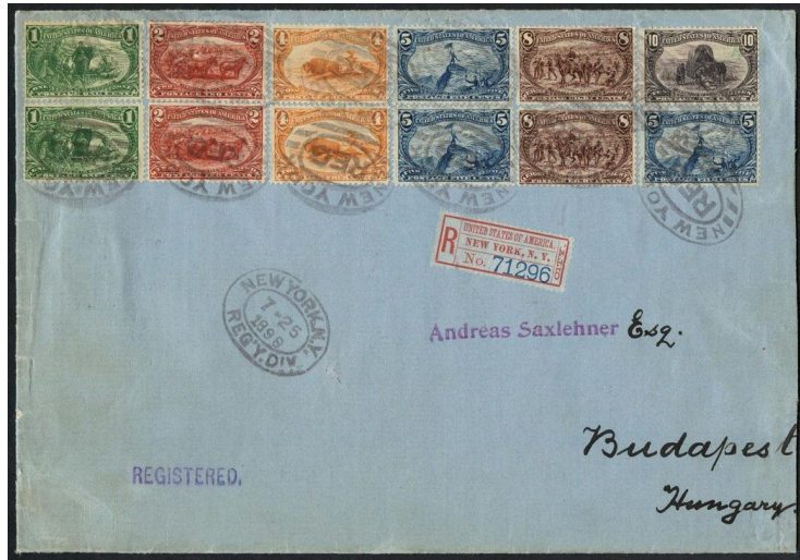
#285-290 ON REGISTERED COVER NEW YORK TO BUDAPEST, HUNGARY