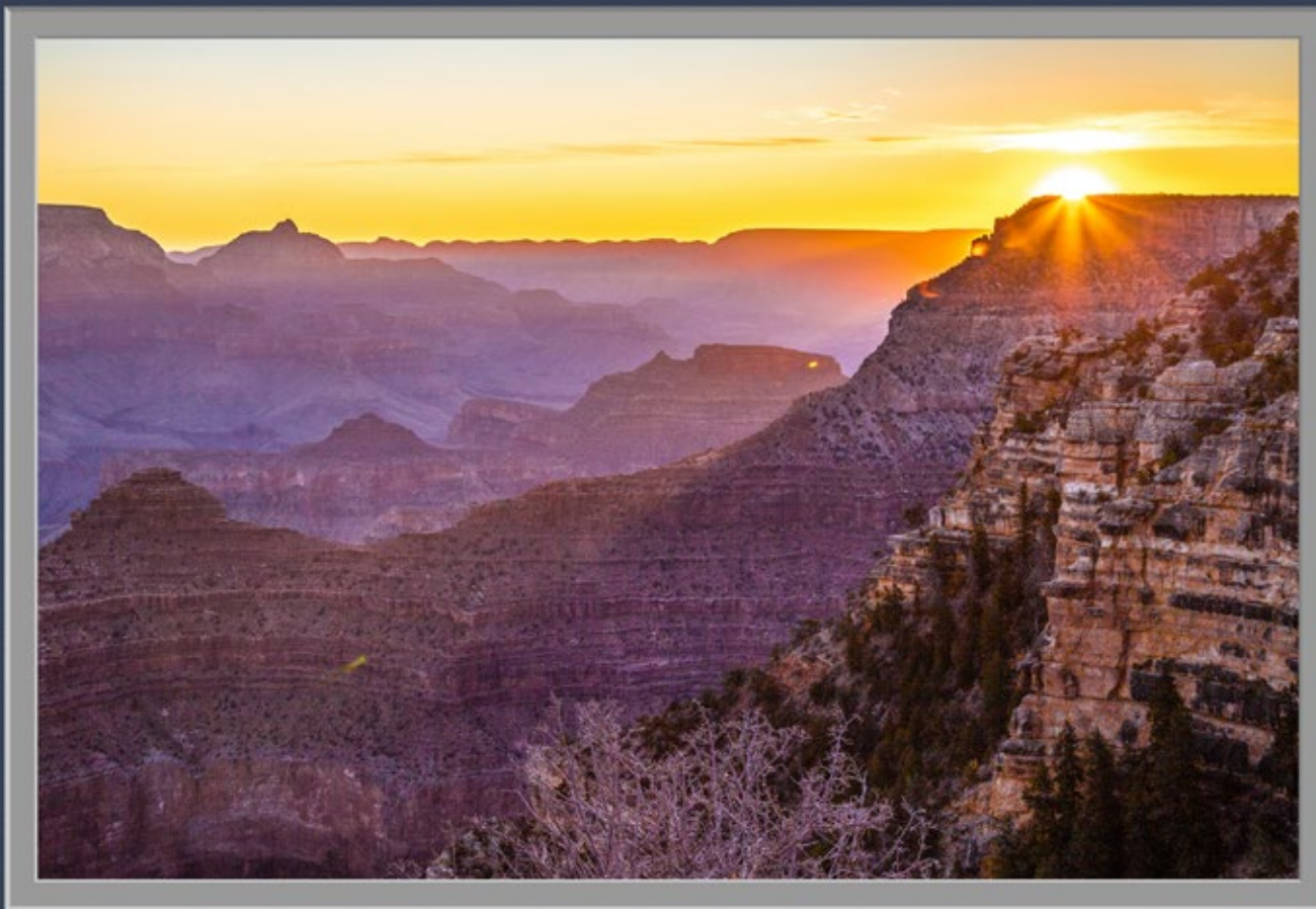
Gallery Giclee Fine Art Prints With Digital Matting