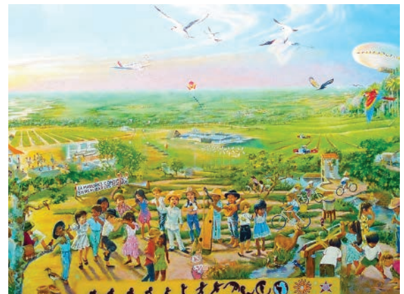
Mural about the whole Gaviotas located at its Multiple Hall.

Dialoging, in Gaviotas we are always in the permanent search for temporal truths without forgetting that there is nothing more productive than the humility.