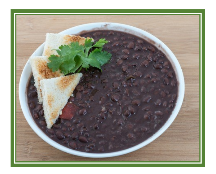
12 oz. black beans, rinsed 2 tsp. canola oil 1 large onion, finely diced 1 large carrot, finely diced 2 celery stalks, finely diced 2 garlic cloves, minced 6 cups low fat-sodium chicken stock 1 bouquet garni Salt and pepper to taste

Place the beans in a large pot and cover with water. Bring to a boil over high heat. Remove from heat and let soak for an hour. Drain and set aside.