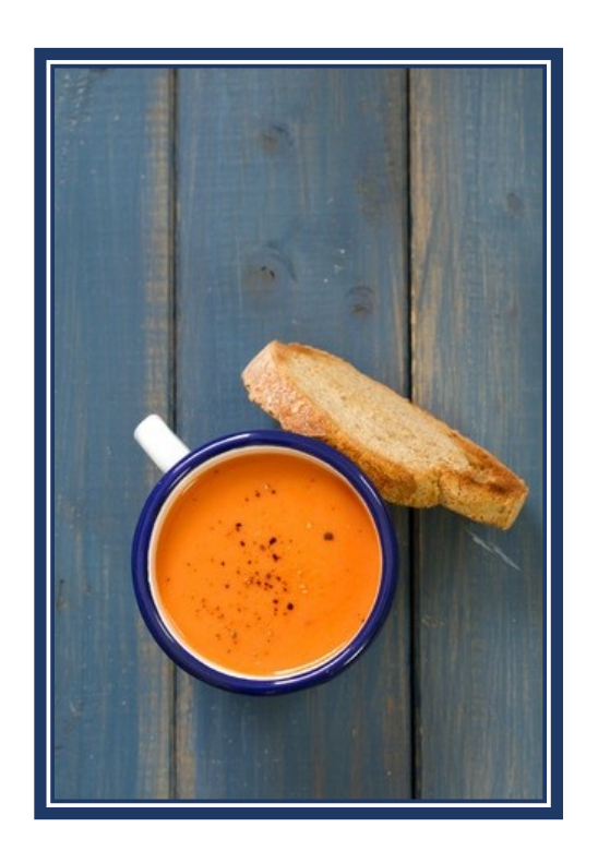
2 tsp. canola oil 2 leeks, cleaned and medium diced 6 garlic cloves, minced 2 cups tomatoes, peeled, seeded, and medium diced 1 ½ cups potatoes, medium diced A few saffron threads 5 cups vegetable stock 1 bay leaf 1 large pinch dry thyme Salt and pepper to taste

Heat the oil in a large pan over medium high heat. Add leeks, garlic, and sauté for 2 minutes. Add tomatoes, potatoes, saffron, stock, bay leaf, thyme, and bring to a simmer. Reduce heat and continue to cook the vegetables until very tender.