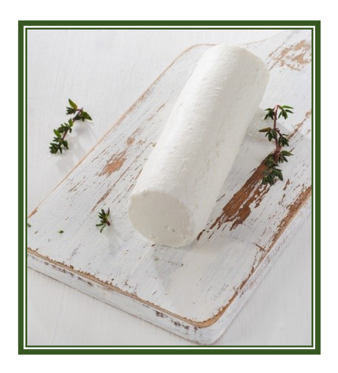
1 - approx. 11 oz. plain goat cheese log 8 Tbsp. medium coarse ground flaxseed 2 Tbsp. paprika 1 Tbsp. Cajun spices 4 Tbsp. raw honey, warm 2 thyme branches

Mix the flaxseed, paprika and Cajun spices in a plate. Brush the warmed honey over the goat cheese log. Roll the log into the prepared mix. Decorate with thyme branches and refrigerate until use.