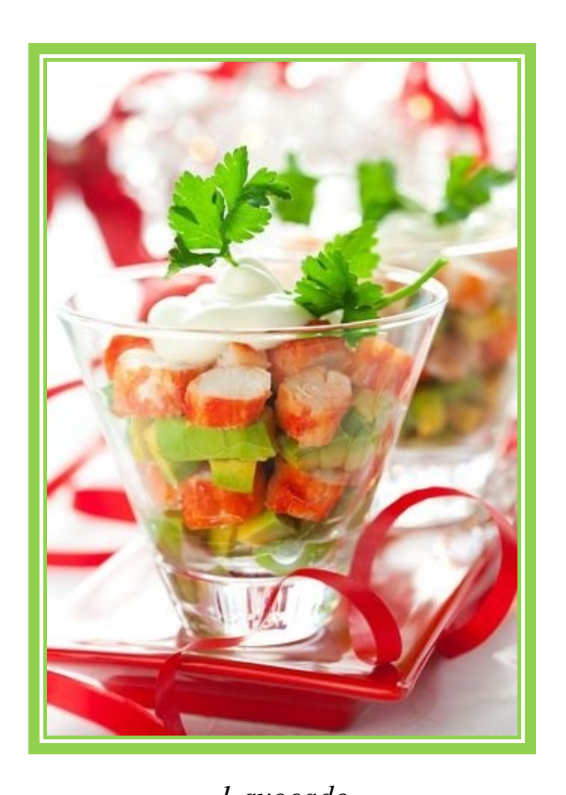
I avocado Half a lemon 6 oz. crabmeat 2 Tbsp. olive oil I Tbsp. lemon juice Dash of Worcestershire 3 tsp. freshly minced salad herbs Salt and pepper to taste 2 Tbsp. low-fat sour cream 2 glasses Parsley to decor

In a bowl mix the olive oil, lemon juice, Worcestershire, 2 tsp. herbs, and season to taste.