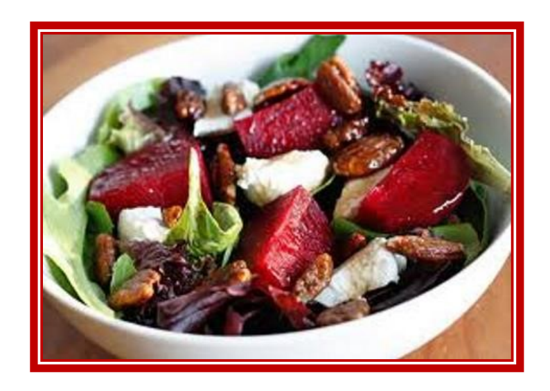
4 beets 2 medium Jicama; peeled, halved and sliced 1/4 red onion, diced 4 oz. crumbled goat cheese 1 cup salad greens 4 Tbsp. salad herbs 4 Tbsp. vinaigrette 4 tsp. chopped walnuts or pecans Salt and pepper to taste

Parboil the beet and cook until tender. Time may vary based on their sizes (20 to 25 minutes for medium sizes). Remove from water and cool. Trim the tops and peel the skin. Slice and set aside.