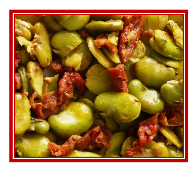
2 cups of fresh shelled fava beans 2 garlic cloves, chopped 4 large sun-dried tomatoes 2 pinches of freshly minced thyme 2 pinches of freshly minced rosemary Lemon juice to taste 6 Tbsp. extra-virgin olive oil Salt and pepper to taste

Bring a pan filled with water to a boil. Add the shelled fava beans for simmer for 6 to 7 minutes or until tender.