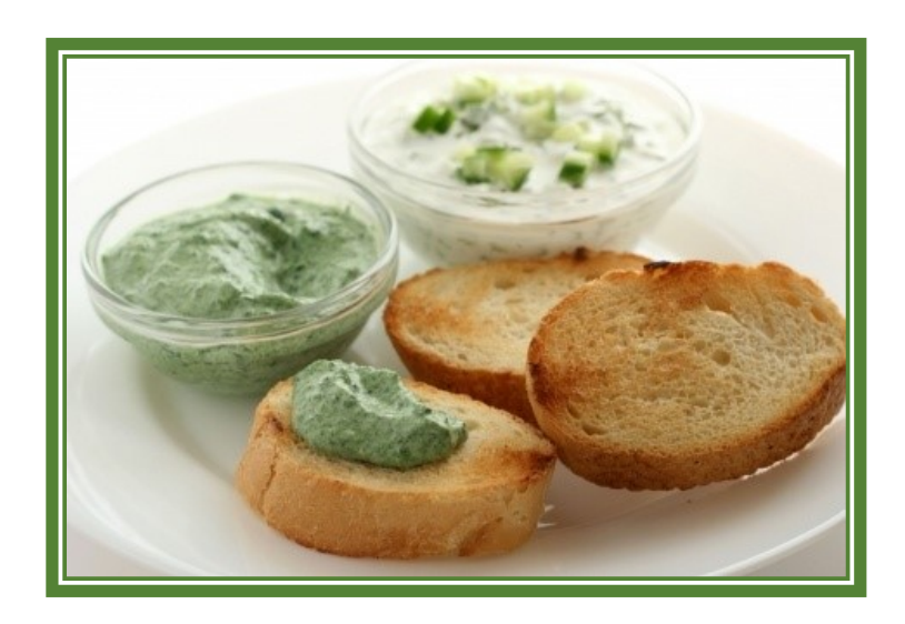
1 Tbsp. olive oil 2 cups kale, cleaned and chopped 1 cup spinach, cleaned and chopped 1 large carrot, peeled and shredded 1 cup low-fat plain Greek yogurt 1 garlic clove 1 Tbsp. lemon juice 1 ½ Tbsp. parmesan cheese 2 Tbsp. freshly minced salad herbs Salt and cayenne pepper to taste

Heat half of the oil in a large sauté pan. Add the kale and sauté until almost cooked through, about 3 minutes. Add the spinach and continue to cook for another minute or two. Transfer to the food processor, add the shredded carrots, yogurt, garlic, lemon juice, parmesan cheese, and herbs. Purée until the mixture is smooth. Season to taste and refrigerate for half an hour or until use.