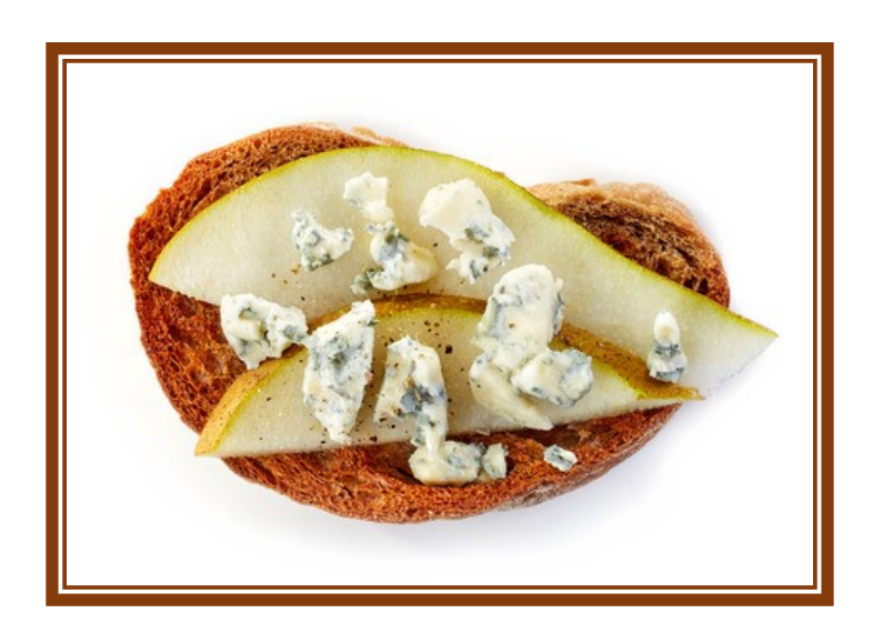
1 toasted walnut, country or pumpernickel bread slice 2 to 3 pear slices A few pieces of Roquefort cheese Pepper to taste

Top toasted bread slice with pear slices. Sprinkle cheese, pepper to taste and serve immediately.