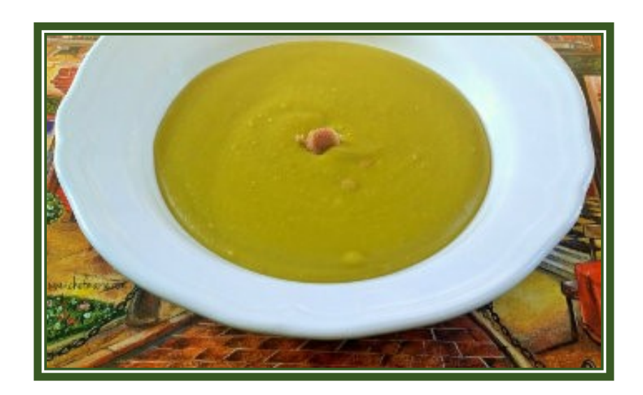
1 ham hock 2 lbs. split peas 1 large onion, diced 2 carrots, diced 1 garlic clove, minced 6 cups vegetables stock 1 tsp. Italian herbs Salt and pepper to taste

Place ham hock, split peas and vegetables in a large pan. Pour over the vegetables stock and add the Italian herbs. If necessary, add enough water to barely cover the ham hock. Bring to boil over medium high heat. Reduce heat and cover leaving a small space for steam to escape. Simmer for 30 minutes or until the split peas are starting to fall apart. Remove ham hock and purée the soup with a hand blender. Adjust seasoning and to the desired consistency. You can do that by either adding more stock or by reducing the soup over medium heat, stirring often to avoid burning on bottom of the pan.