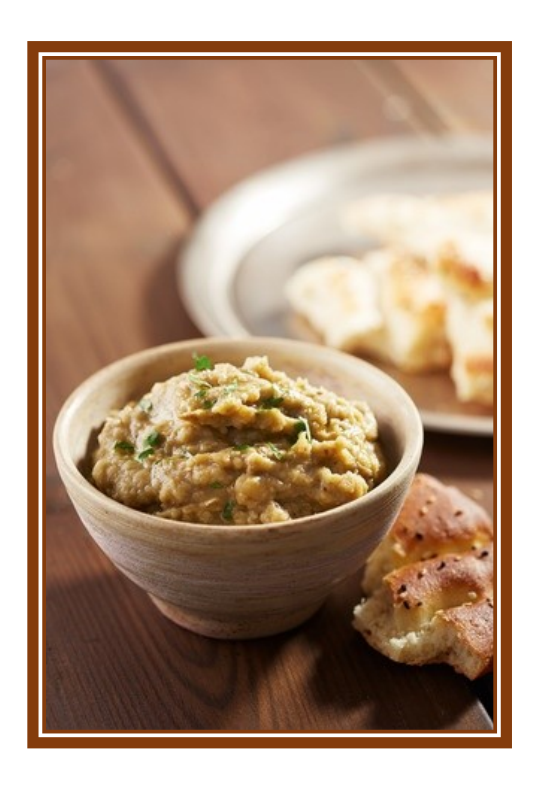
1 Tbsp. olive oil 1 large eggplant 2 garlic cloves, peeled 1/4 to 1/3 cup Tahini paste 2 Tbsp. lemon juice Salt and pepper to taste

Slice eggplant in half lengthwise and brush with olive oil. Place upside down on sheet pan. Broil until the skin is charred black and the pulp soft (approximately 20 to 30 minutes). Scrape out the flesh and refrigerate in a bowl for several hours.