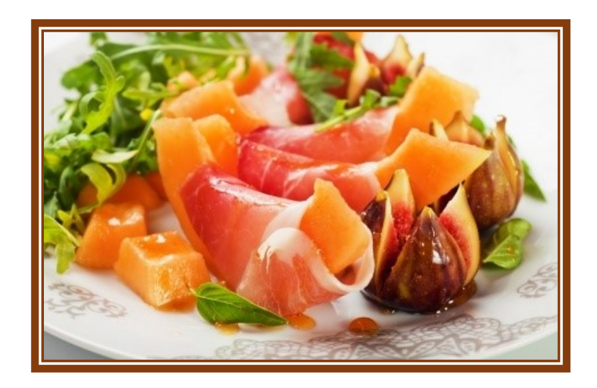
I cantaloupe 4 slices Prosciutto 4 fresh figs A bunch of Arugula mixed with some vinaigrette Pepper to taste

Cut the cantaloupe in half. Scoop out the seeds and drain the liquid. Cut each half into half again and remove skin. Cut open the figs without breaking through their bottoms.