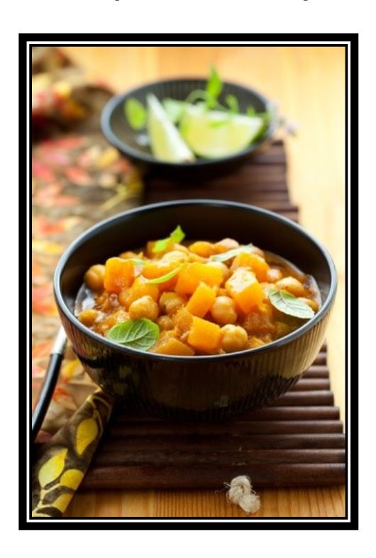
3.5 lbs. pumpkin; peeled, seeded and cubed 1 Tbsp. canola oil 1 large onion, cubed 2 tsp. Spice Hunter curry seasoning 1 (14 oz.) can organic light coconut milk 2 (14.5 oz.) cans organic low-sodium vegetable broth 1 (15 oz.) can organic chickpeas, drained Salt and pepper to taste

Steam the pumpkin until cooked, but still firm.