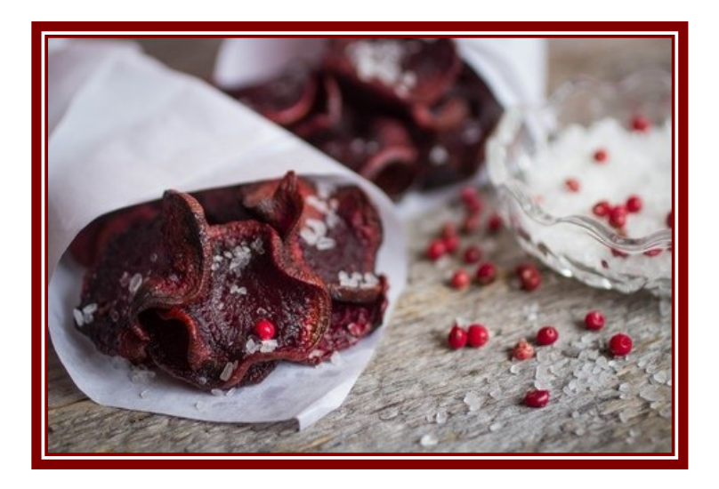
1 tsp. grape seed oil 2 large beets Garlic powder to taste Salt and pepper to taste