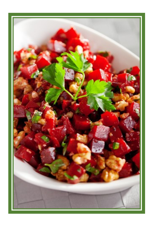
2 large red beets (20 oz.) 1/4 cup walnuts 1 small shallot, minced 1 large garlic clove, minced 1/2 tsp. Dijon mustard 1-1/2 Tbsp. lemon juice 3 Tbsp. walnut oil 1 Tbsp. freshly minced parsley Salt and pepper to taste

Place the beets in a large pan, cover with water, and bring to a boil over high heat. Reduce heat, cover, and simmer for 30 minutes or until the beets are cooked through. Drain and cool. Peel, dice, and place in a serving bowl.