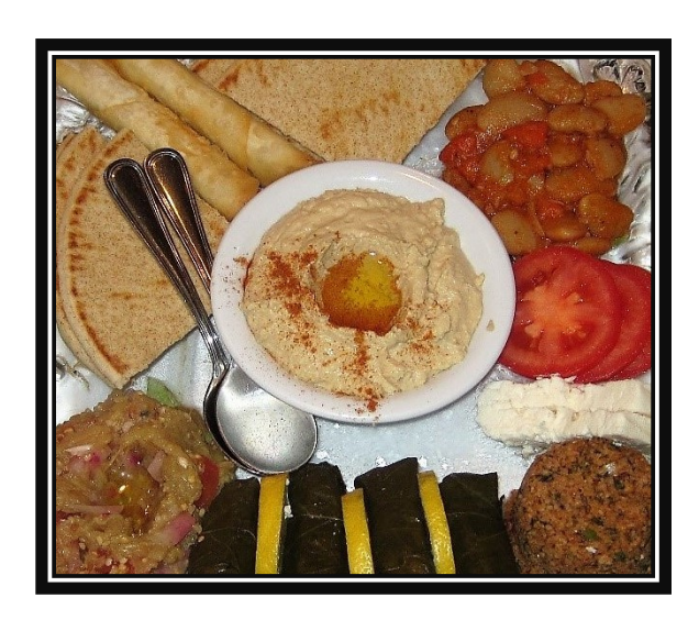
1 lb. dry chickpeas 2 garlic cloves, peeled 7 Tbsp. Sesame Tahini paste 2 Tbsp. lemon juice 5 Tbsps. olive oil or 1 Tbsp. olive oil plus 3-4 Tbsps. cooking liquid Salt and pepper to taste

Rinse and drain chickpeas. Place chickpeas in a large pot and add enough water to cover them. Cook for 60 minutes or until tender. Drain and set some of the liquid aside. Cool the chickpeas completely. In a food processor; mash chickpeas, Tahini paste, garlic, lemon juice, and olive oil. You should have a creamy but thick paste. If too thick, thin out with cooking liquid and more lemon juice. Taste and adjust seasonings. Refrigerate for 20 to 30 minutes before use.