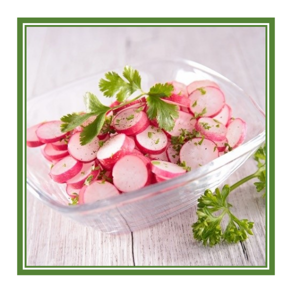
2 bunches of elongated radishes 1 shallot, minced 1 garlic clove, minced 1 lemon, juiced 3 Tbsp. olive oil 2 Tbsp. freshly minced salad herbs Salt and pepper to taste Parsley for decoration

Mix the shallot, garlic, lemon juice, olive oil and salad herbs in a bowl. Season to taste and set aside.