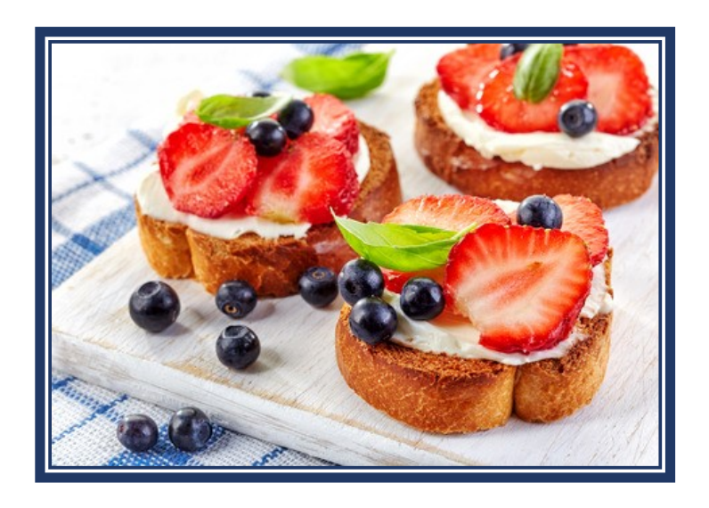
4 round toasted baguette slices 4 Tbsp. low-fat cream cheese 12 thick strawberry slices A few blueberries for décor A few basil or mint leaves for décor

Spread the low-fat cream cheese over the toasted slices. Top with strawberry slices. Décor with blueberries, basil or mint, and serve immediately.