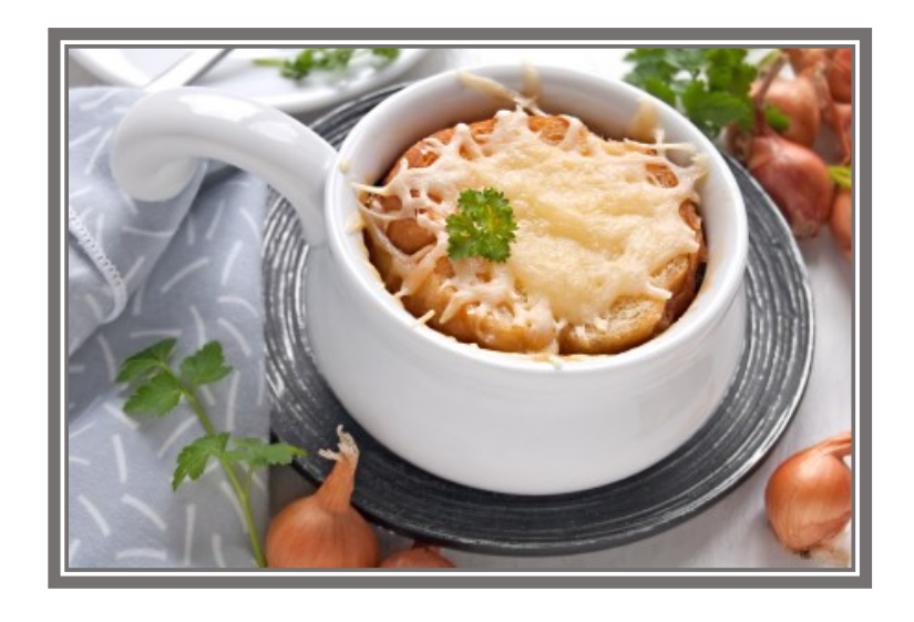
2 Tbsp. grapeseed oil 3 large onions, thinly sliced (1.5 lbs.) 2 Tbsp. Cognac 2 Tbsp. flour 6 to 7 cups beef stock (low fat/sodium) Salt and pepper to taste

Heat the oil in a large pan over medium heat. Add the onions and cook until golden brown. Stir occasionally to avoid burning. This will take up to 20 minutes. Carefully add the Cognac and flambé. When the flame dies, sprinkle the flour, and mix well. Add the beef stock and bring to a boil over high heat. Reduce heat and simmer for 20 to 25 minutes. Skim any foam that forms at the surface. Adjust seasoning and serve immediately.