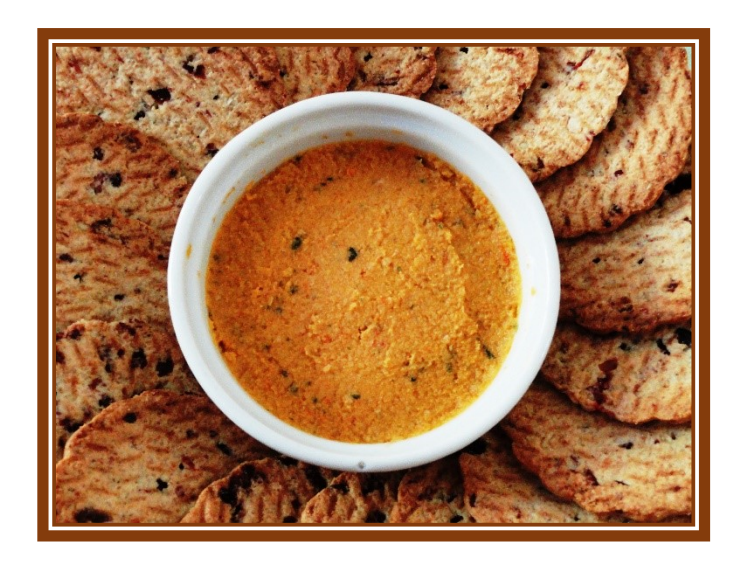
1 lb. dry chickpeas 2 garlic cloves, peeled 7 Tbsp. Sesame Tahini paste 2 Tbsp. lemon juice 5 Tbsp. olive oil 4 to 6 dried tomatoes Salt and pepper

Rinse and drain chickpeas. Place chickpeas in a large pot and add enough water to cover them. Cook for 60 minutes or until tender. Drain and set the liquid aside. Cool the chickpeas completely.