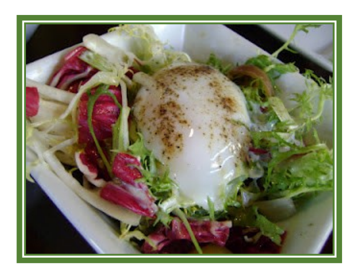
1 cup mixed greens 1 Tbsp. vinaigrette 1 garlic clove, sliced 1 extra-large egg 1 tsp. white vinegar Pinch salt Pinch pepper

Mix the greens with the vinaigrette, garlic, and transfer to a serving plate.