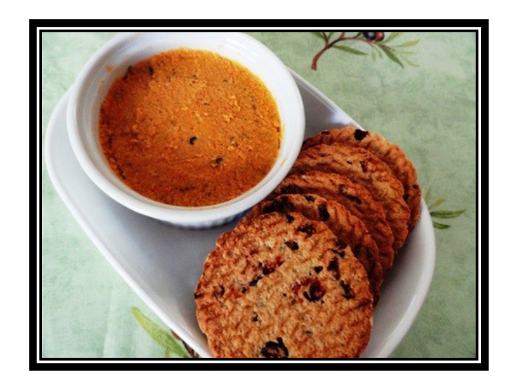
2 Tbsp. almond butter 2 tsp. flax seed oil or walnut oil 1 Tbsp. lemon juice 1 tsp. ground cumin 1/2 tsp. ground coriander 2 cups cooked garbanzo beans 2 cups cooked pumpkin puree 1 garlic clove, smashed 1 tsp. paprika Salt to taste

Combine all ingredients and purée in a food processor until very smooth. Thin out with water, as needed. Serve with pita breads or vegetables.