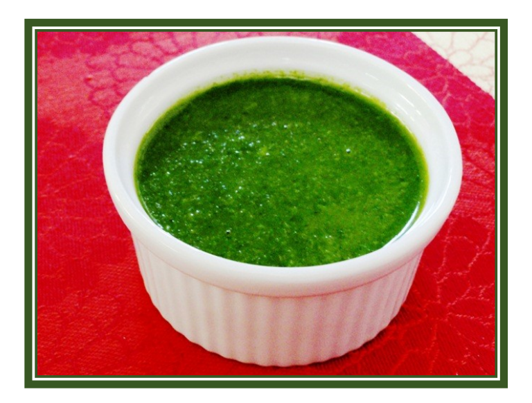
1 cup olive oil 4 to 6 large peeled garlic cloves 2 bunches of fresh basil Salt and pepper to taste

In a blender, purée the olive oil, garlic, and basil. Season to taste and blend for another minute.